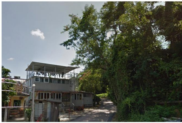
LR 1g Chung Shan Area (low rise with greening)