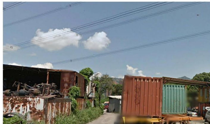
LR 2b - HPR Workshops (with peripheral greening)