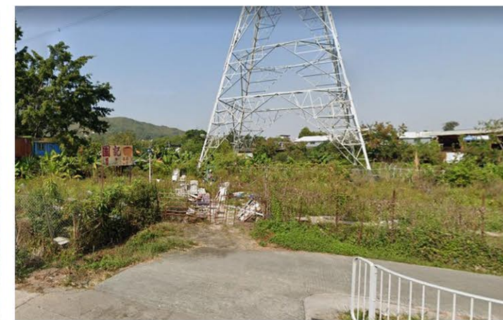
LR 3b - Abandoned Land