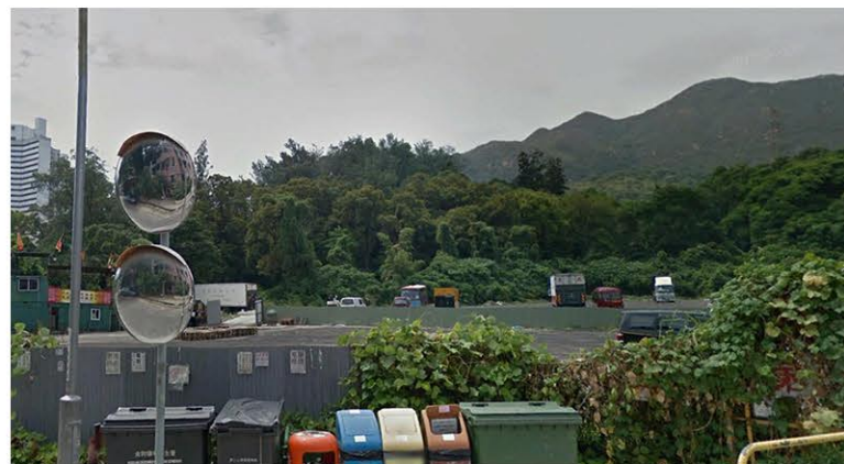
LR 2e - Tong Hang Road Open Storage