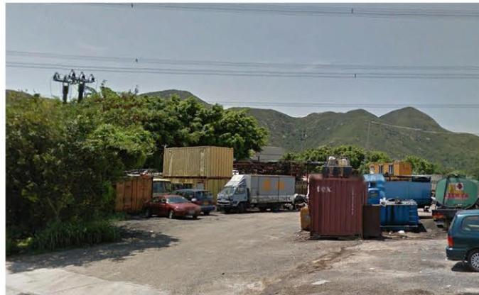
LR 2a - HPR Container Terminal