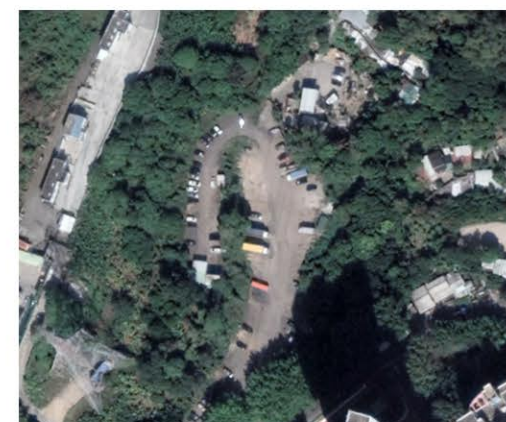
LR 2f - Kwong Shan Tsuen Open Area