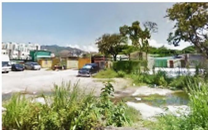
LR 2d - San Hing Tsuen Open Storage