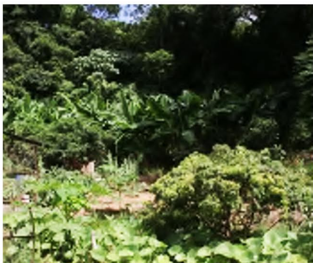
LR 3a - Actively Cultivated Land