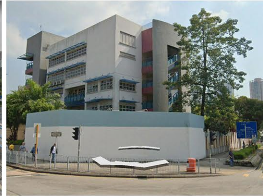
LR 6c - Public Facilities