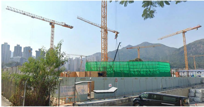
LR 7 - Construction Site