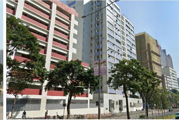
LR 6d - Industrial Blocks