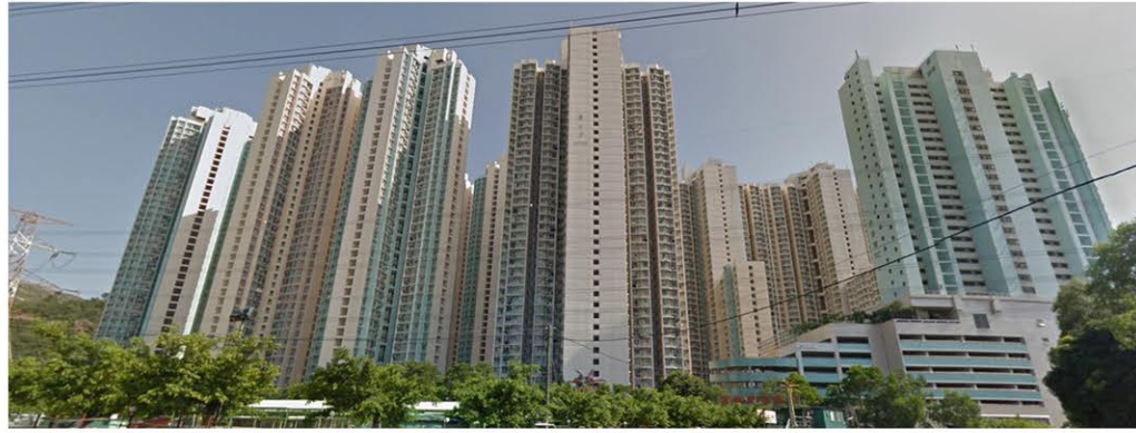
LR 6a - Residential Blocks