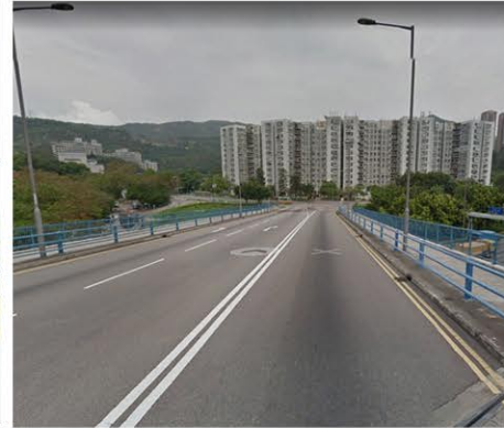
LR 6b - Key Transport Routes