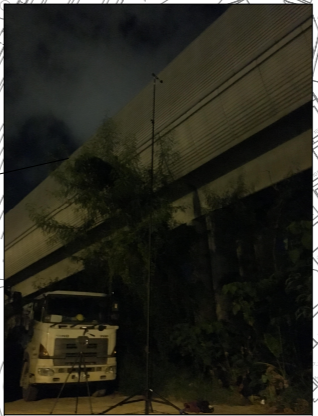
WRL Structural Re-radiated Noise Measurement, Distance 5m from the structure