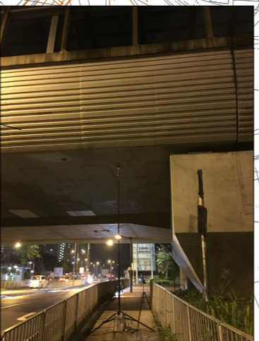
WRL Structural Re-radiated Noise Measurement, Distance 1m from the structure

NOTE: THE LAYOUT IS FOR EIA PURPOSE AND SUBJECT TO REVIEW AND CHANGE.