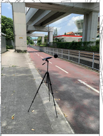
LRT Rolling Noise Measurement, Distance 5m from track