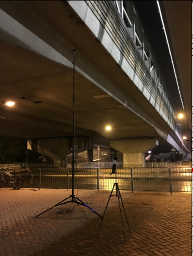
LRT Structural Re-radiated Noise Measurement, Distance 1m from the structure