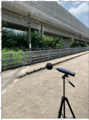
LRT Rolling Noise Measurement, Distance 5m from track