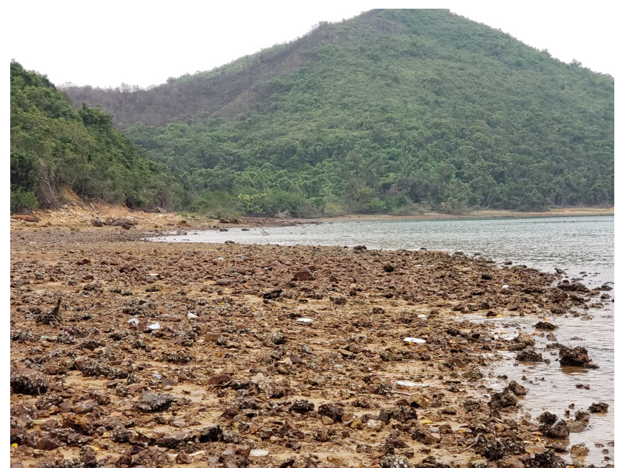
LR3 - ROCKY SHORE ALONG THE COASTLINE OF CROOKED HARBOUR