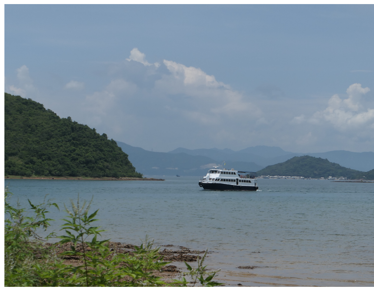
LR1 - INSHORE WATER OF CROOKED HARBOUR NEAR LAI CHI WO