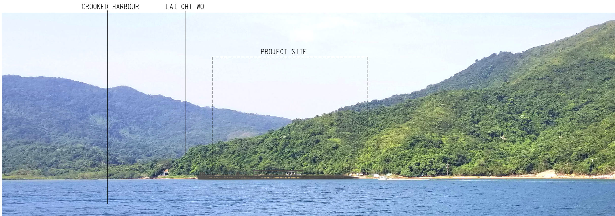
DAY 1 OF OPERATIONAL PHASE WITHOUT MITIGATION MEASURES