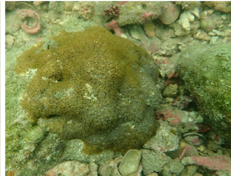
CORAL WITHIN THE PROPOSED WORKS AREA