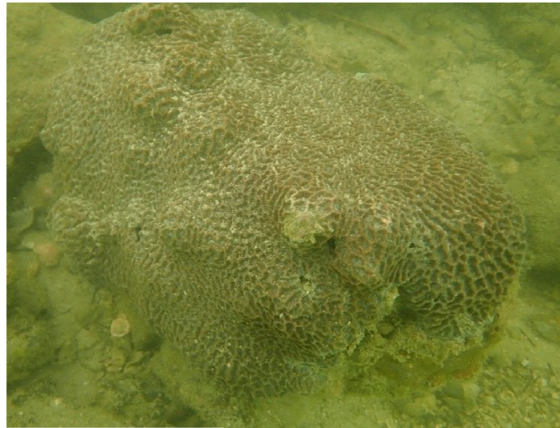
CORAL UNDER CATWALK