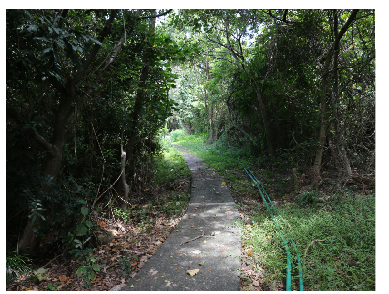
LR3 - WOODLAND IN PLOVER COVE (EXTENSION) COUNTRY PARK