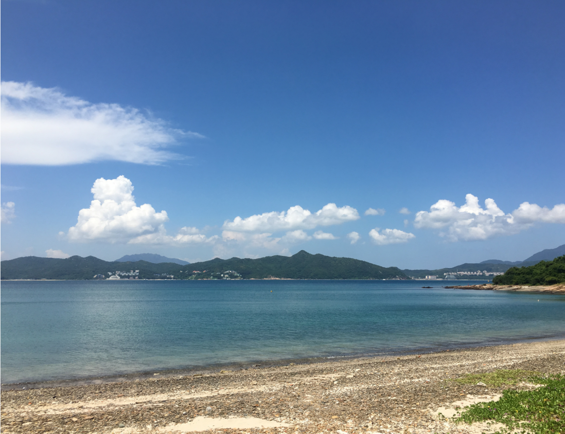
LR2 - SEASHORE ALONG THE COASTLINE OF TUNG PING CHAU