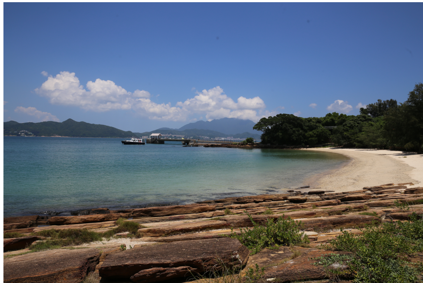
VPB2 - VISUAL CONTEXT OF VSR2 (RESIDENTS AT TAI TONG VILLAGE) TOWARDS SOUTH DIRECTION