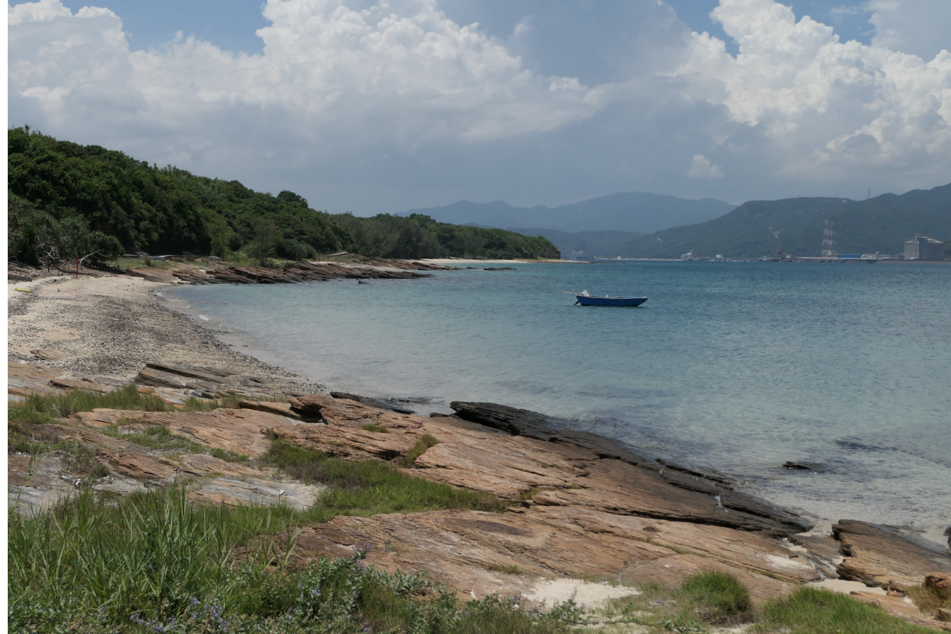
VPB1 - VISUAL CONTEXT OF VSR2 (RESIDENTS AT TAI TONG VILLAGE) TOWARDS NORTH DIRECTION