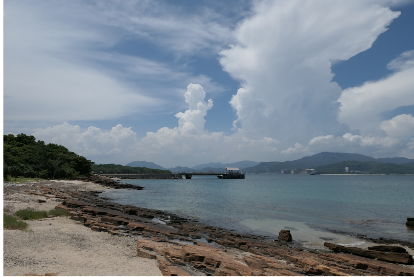
VPC1 - VISUAL CONTEXT OF VSR3 (RESIDENTS AT SHA TAU VILLAGE) TOWARDS NORTHEAST DIRECTION