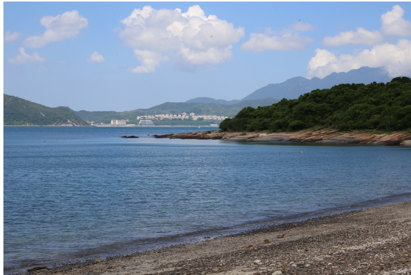
VPC2 - VISUAL CONTEXT OF VSR3 (RESIDENTS AT SHA TAU VILLAGE) TOWARDS EAST DIRECTION