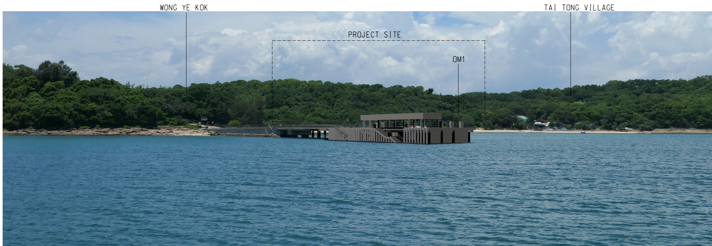
YEAR 10 OF OPERATIONAL PHASE WITH MITIGATION MEASURES