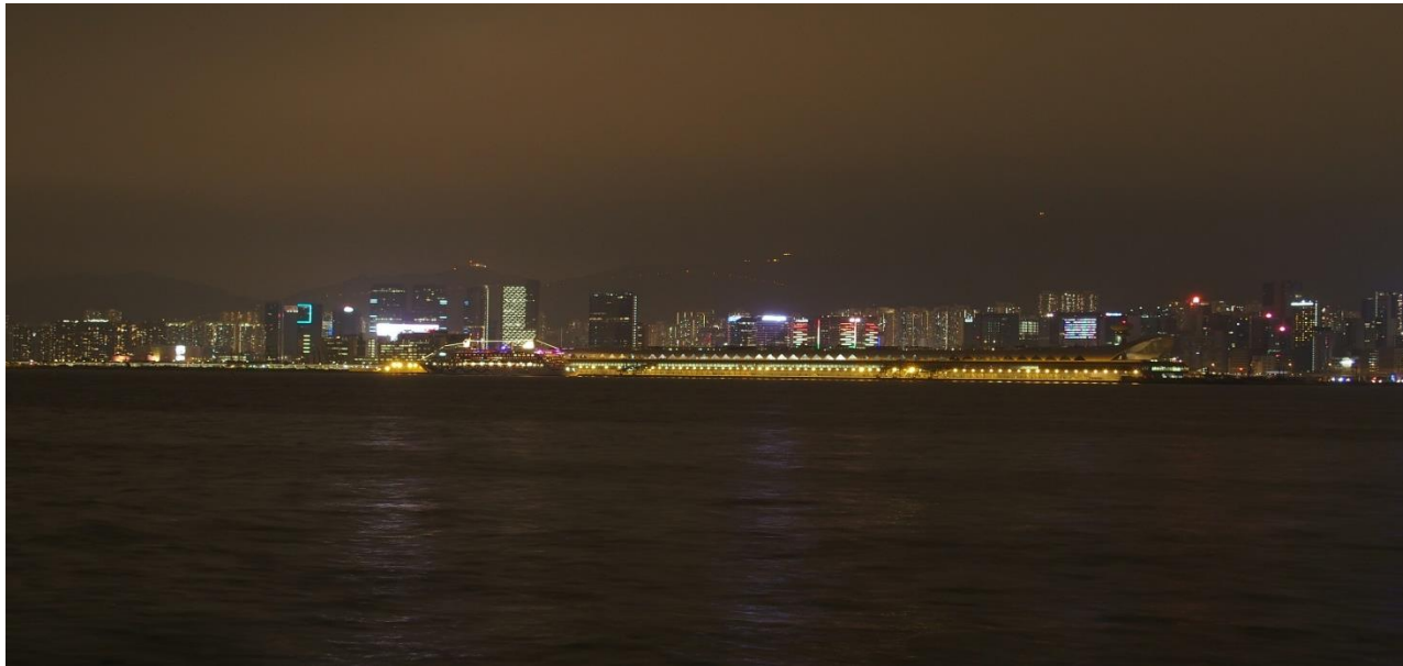
Existing nighttime View at Quarry Bay Park to the Proposed Project