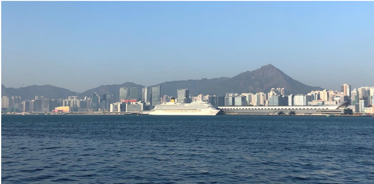
Existing Daytime View at Quarry Bay Park to the Proposed Project