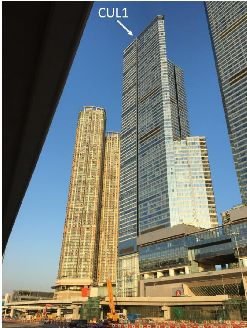
CUL1: The Cullinan I (Tower 21)