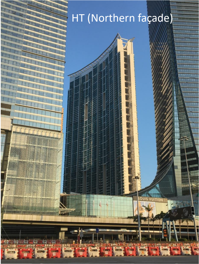
HT (Northern façade)