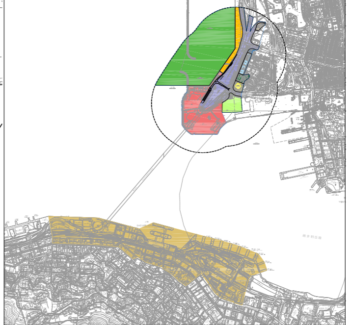
VSR AREA IN HONG KONG ISLAND SCALE 1:10000