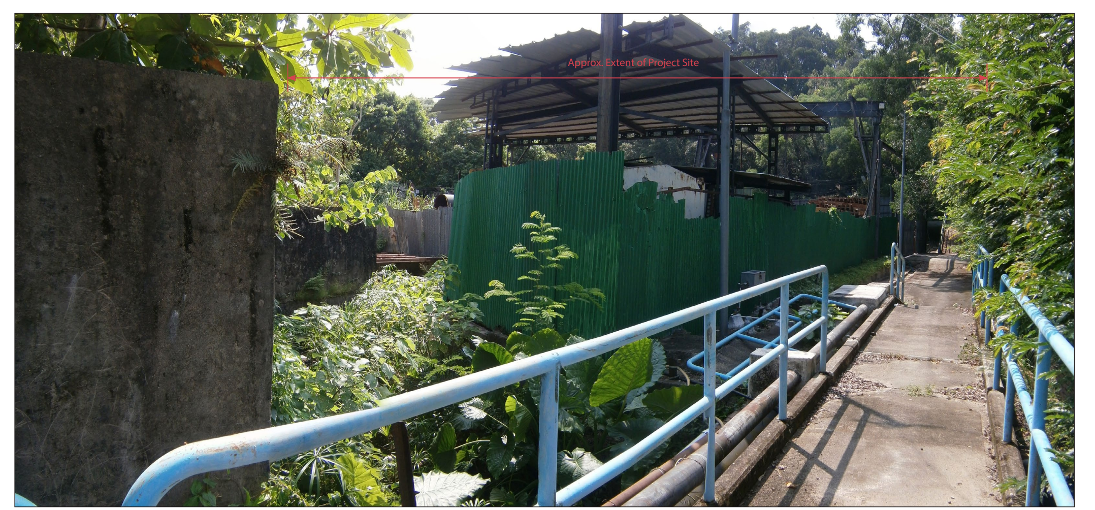
HC-VSR1: Pedestrians on industrial area access road