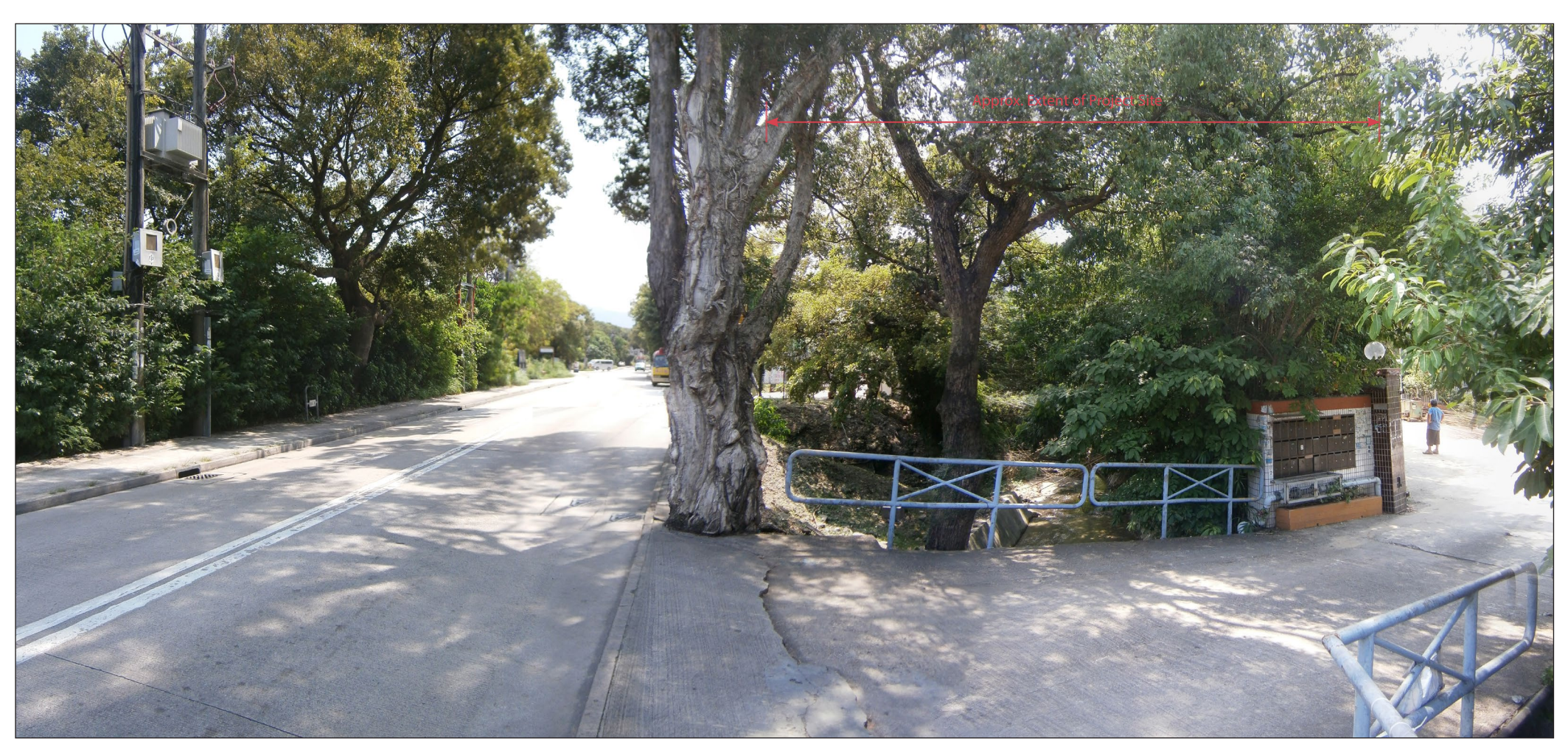
HC-VSR7: Vehicle travellers and pedestrians on Fan Kam Road