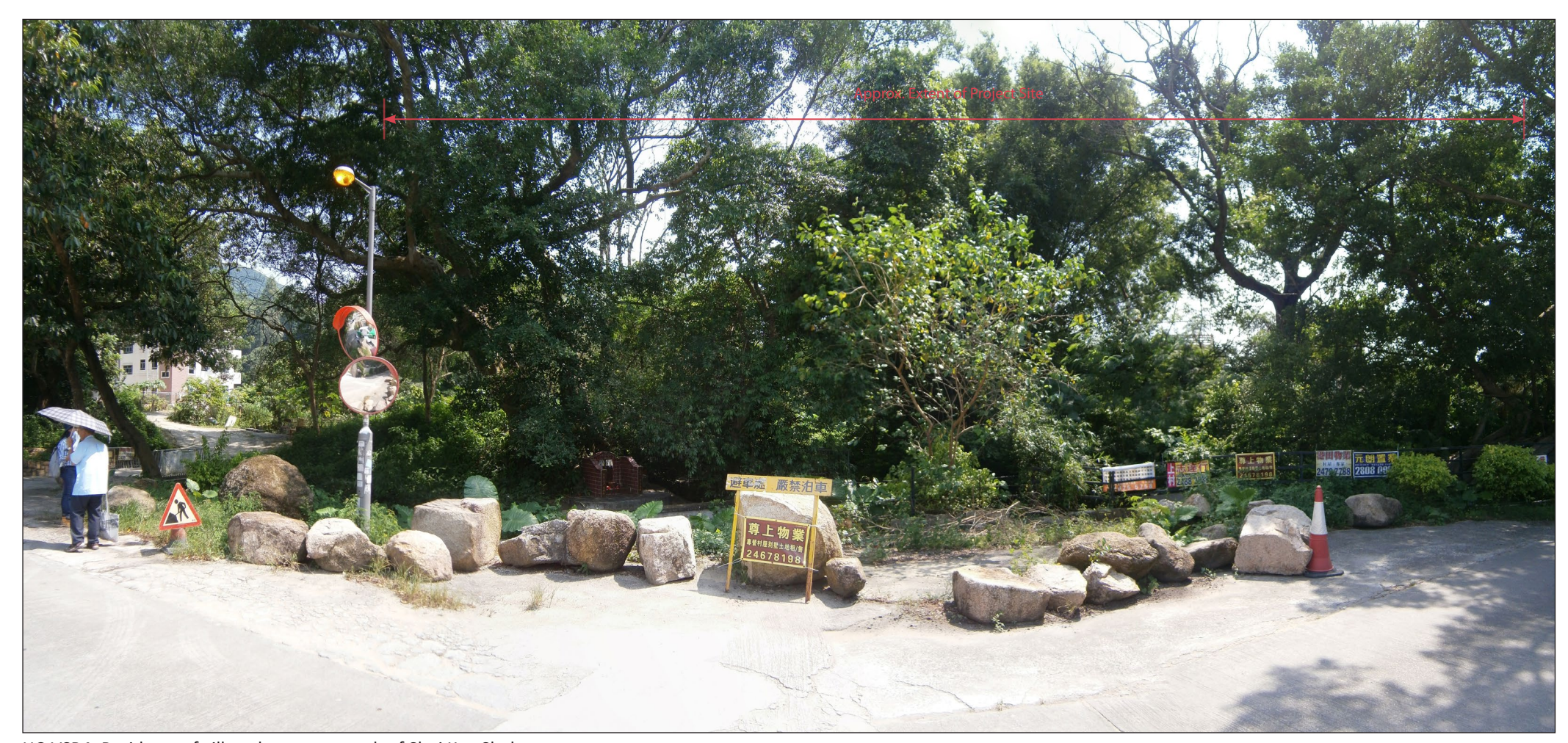
HC-VSR4: Residents of village houses at south of Shui Kan Shek