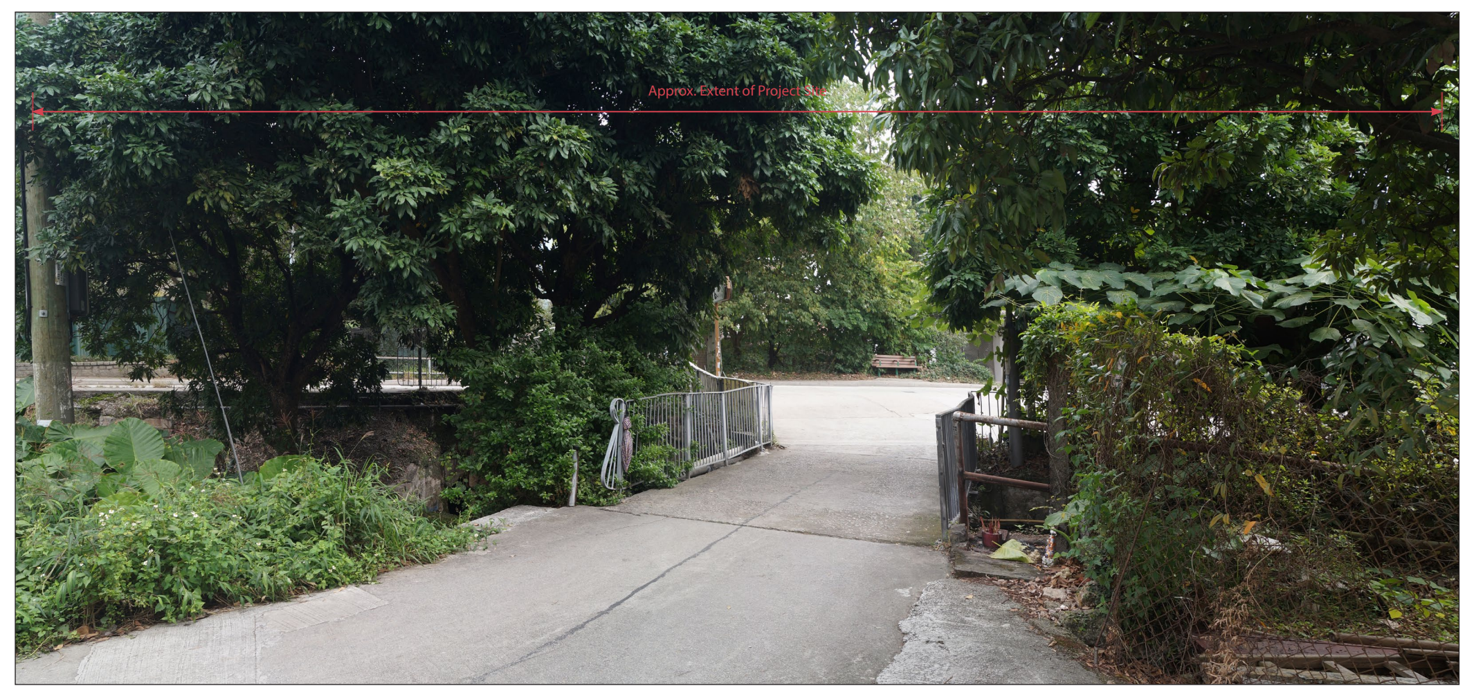
HC-VSR8: Residents of Ha Che bordering Fan Kam Road