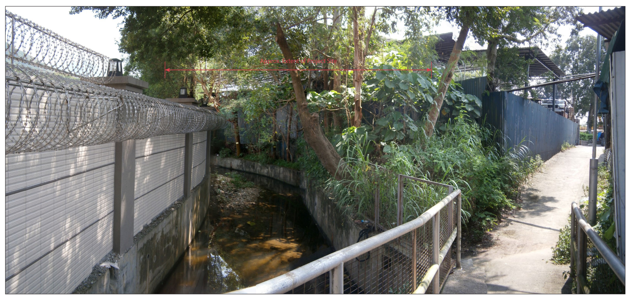
HC-VSR3: Residents on footpath from Fan Kam Road to Shui Kan Shek