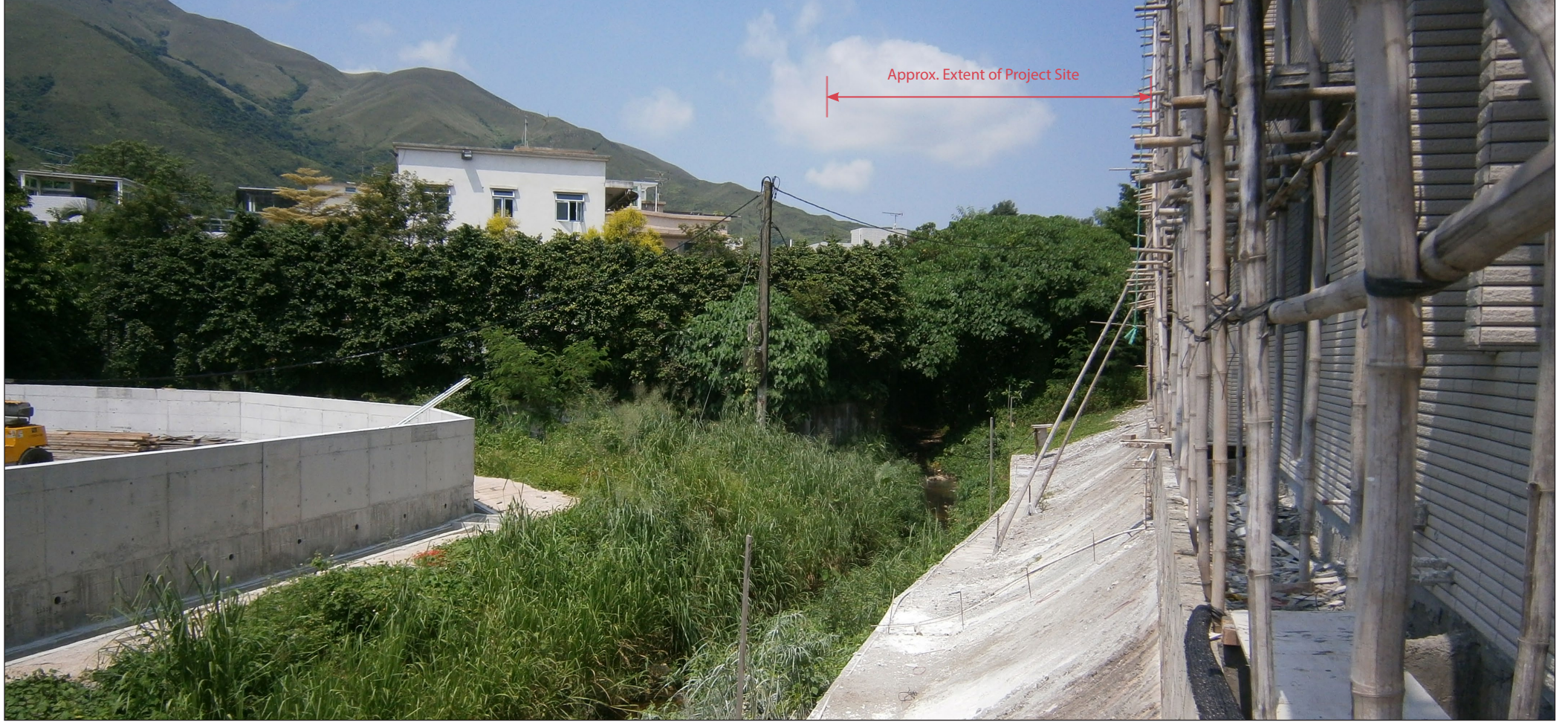
HC-VSR9: Residents of Ha Che (south east)

Rm. 2004, QRC, 299 Queens Road Central, Hong Kong Telephone: +852 2468 2422 Fax: +852 3016 2422 Email: scenic@studioscenic.com