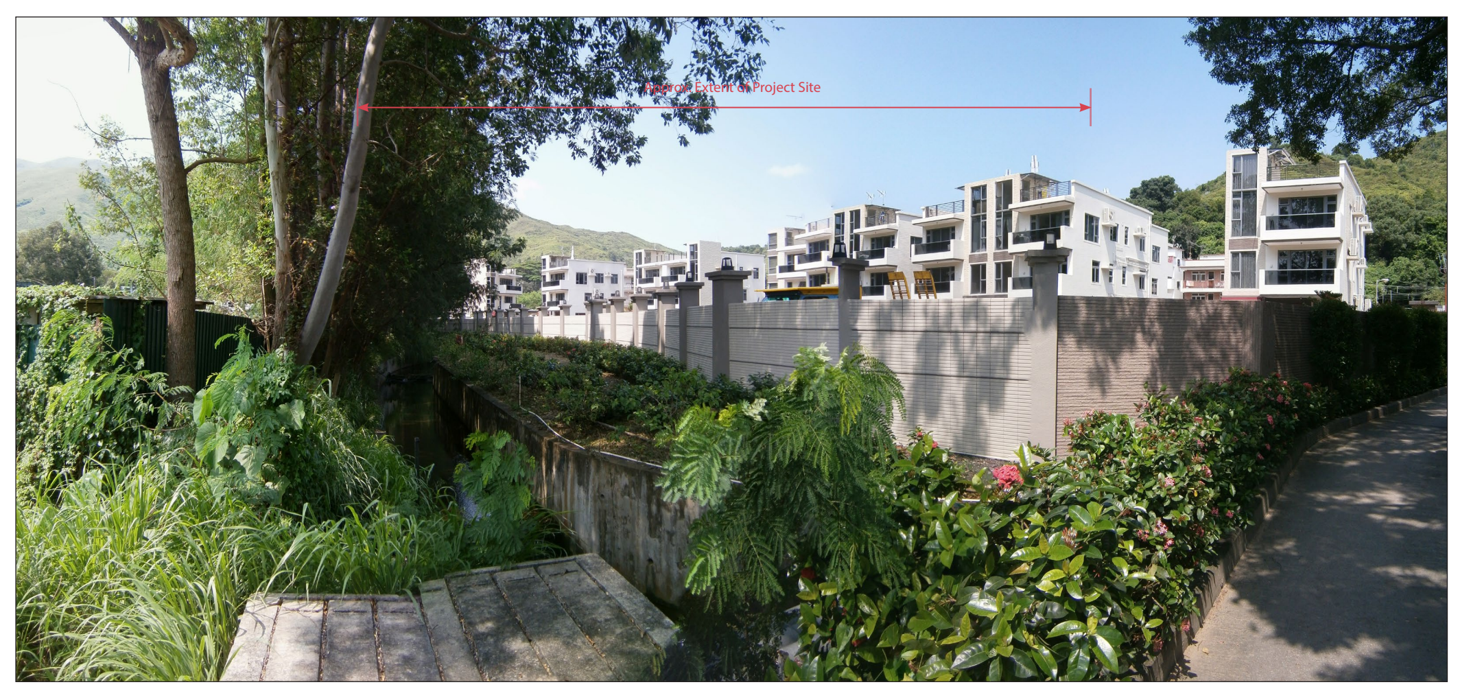
HC-VSR5: Vehicle travellers and pedestrians on Shui Kan Shek access road