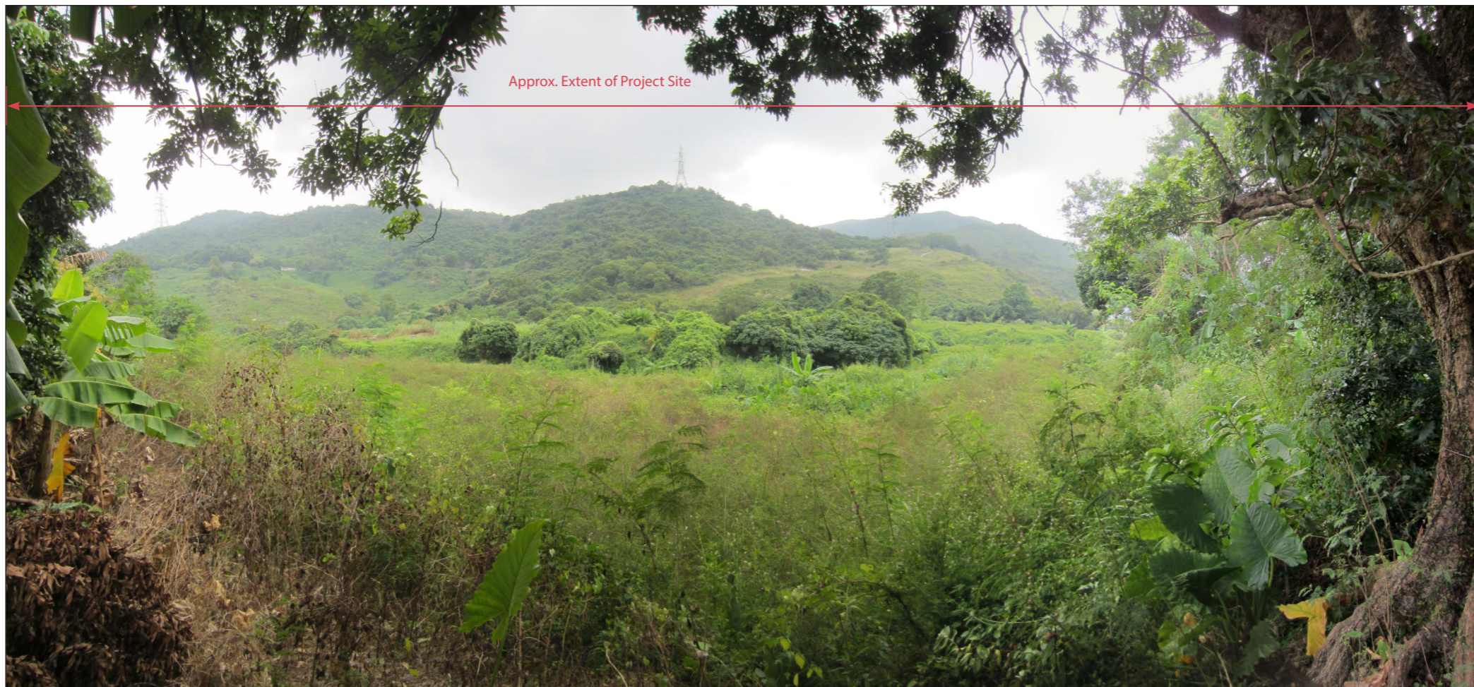
TW-VSR5: Pedestrians on narrow footpath between Tai Wo and Cheung Po