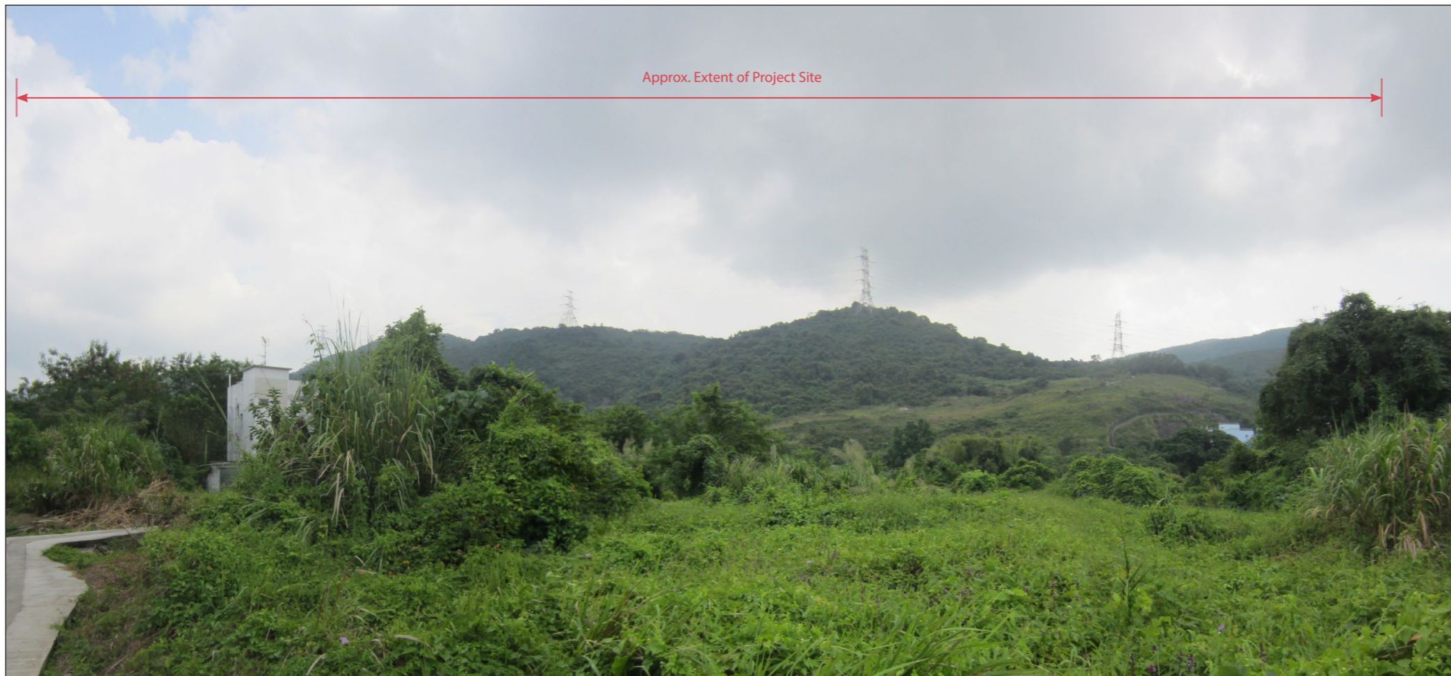
TW-VSR6: Residents of Cheung Po village (south east)