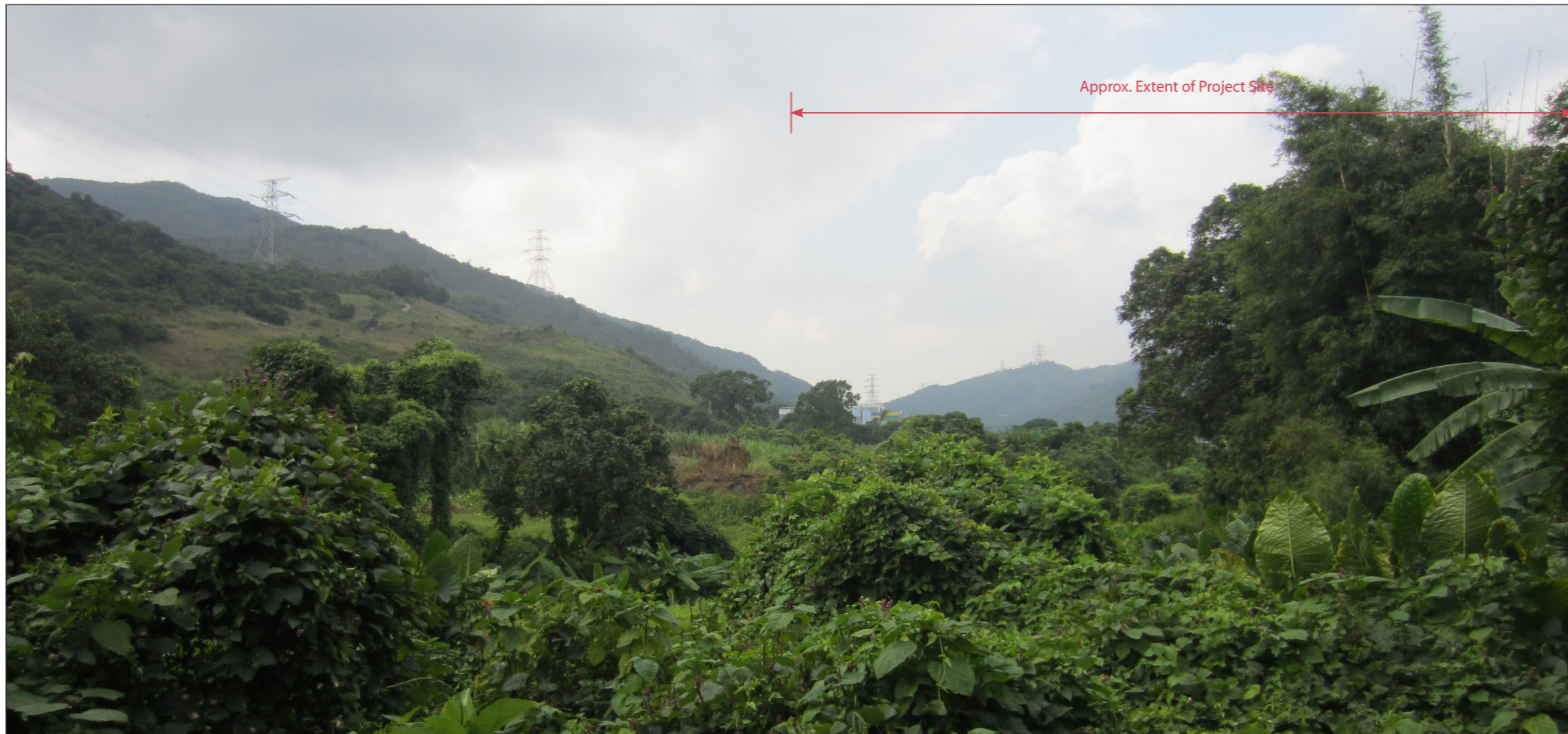
TW-VSR3: Residents of Tai Wo (south)