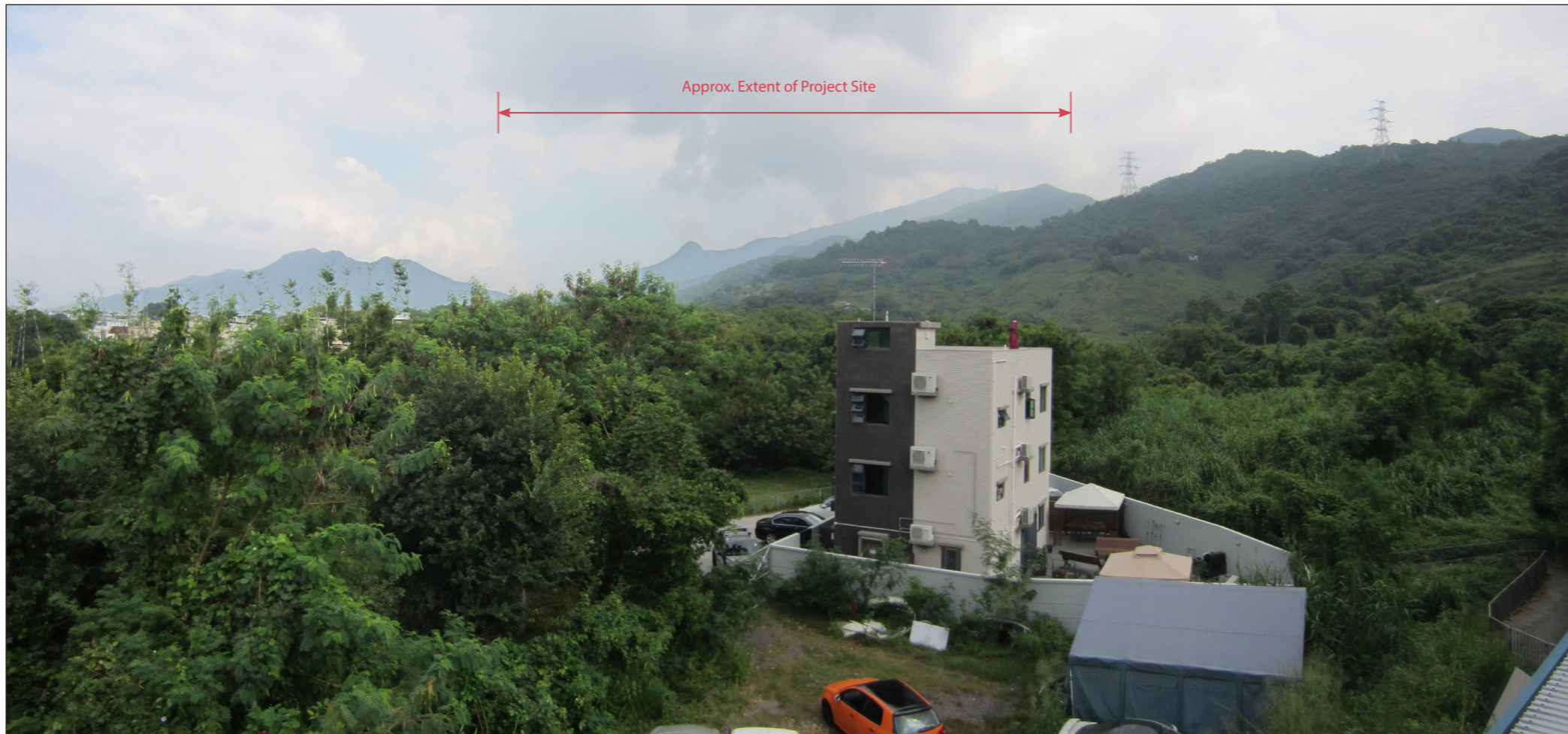
TW-VSR7: Pedestrians on West Rail overbridge to east of site