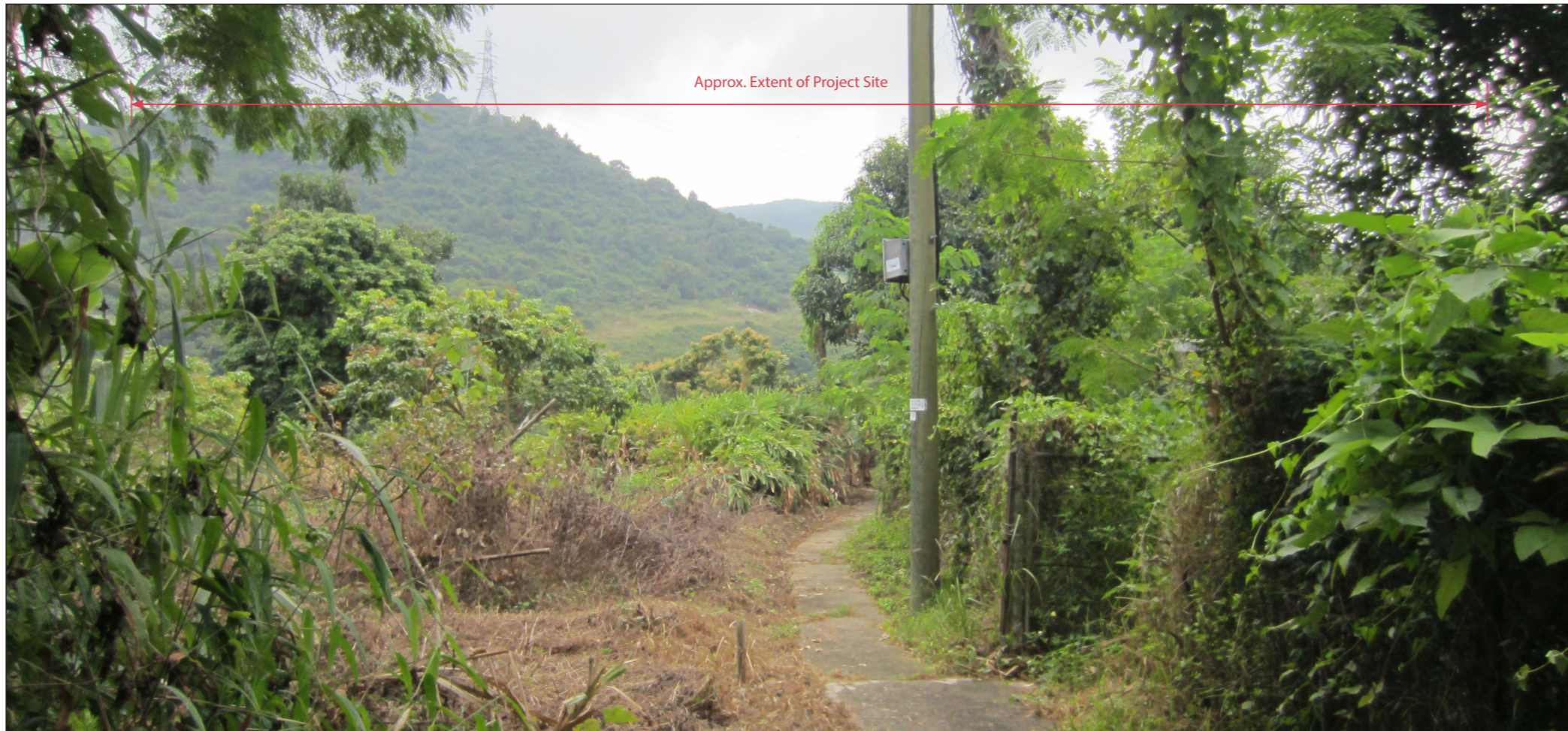
TW-VSR4: Residents of Tai Wo (south west)