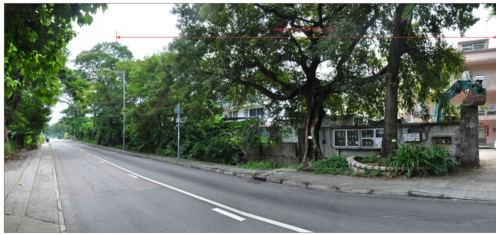
LFT-VSR1: Vehicle travellers and pedestrians on Kam Sheung Road