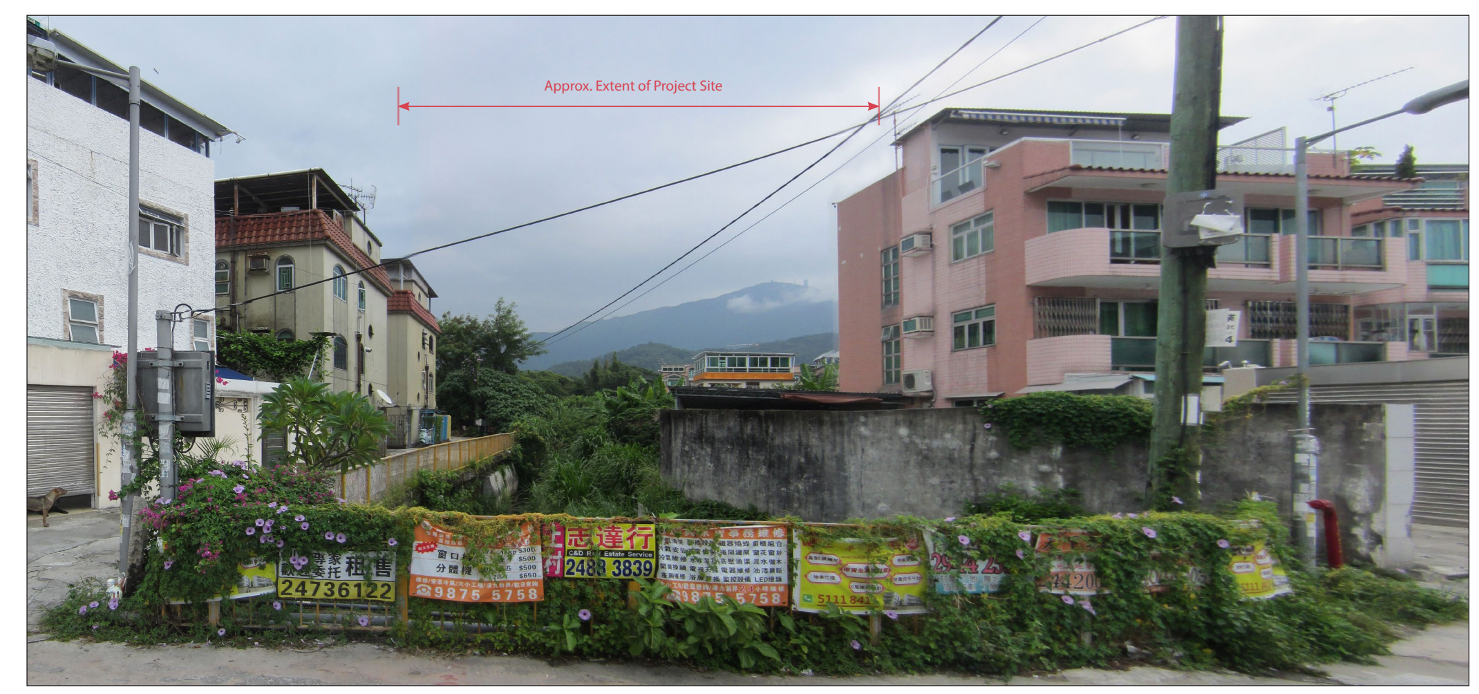
LFT-VSR6: Vehicle travellers and pedestrians at channel crossing in Lin Fa Tei