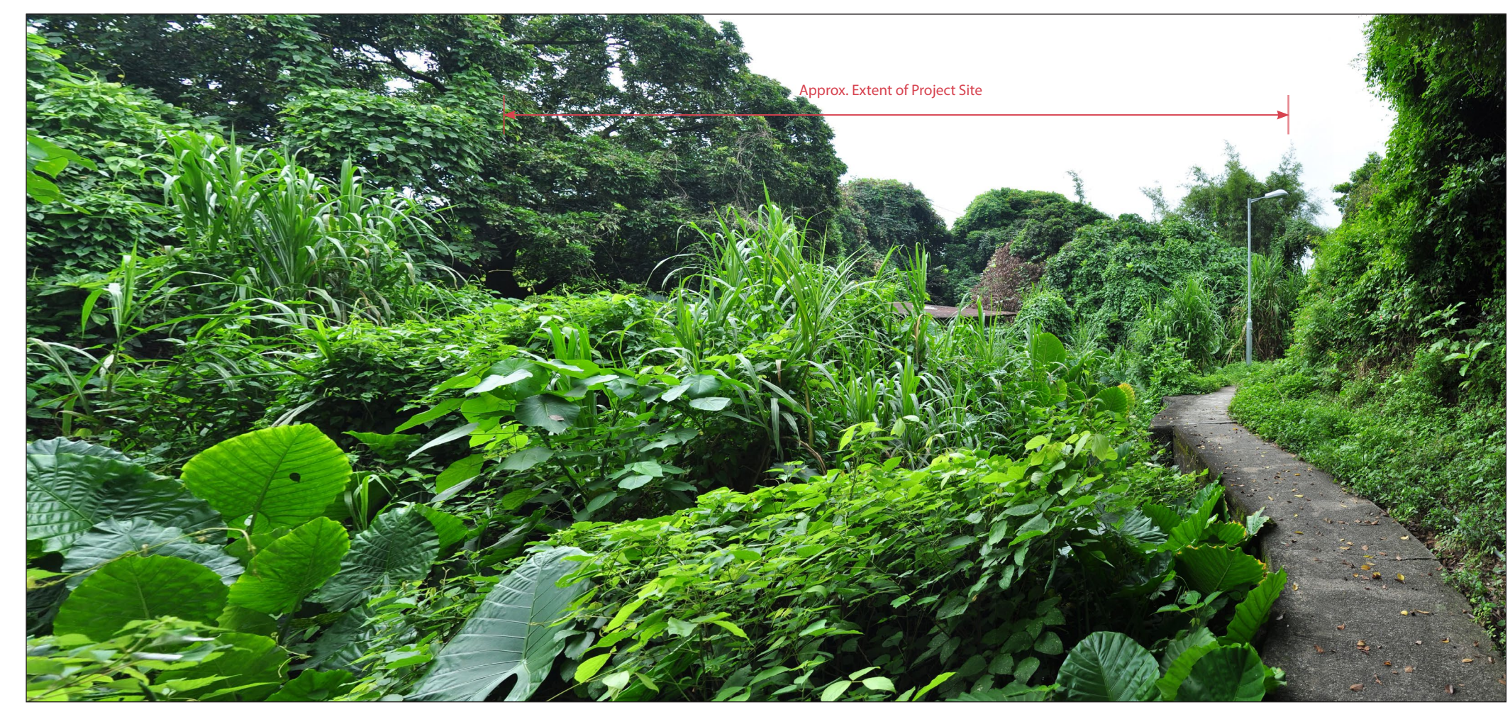
LFT-VSR9: LFT-VSR 9 Pedestrians on riverside footpath to south west of Lin Fa Tei