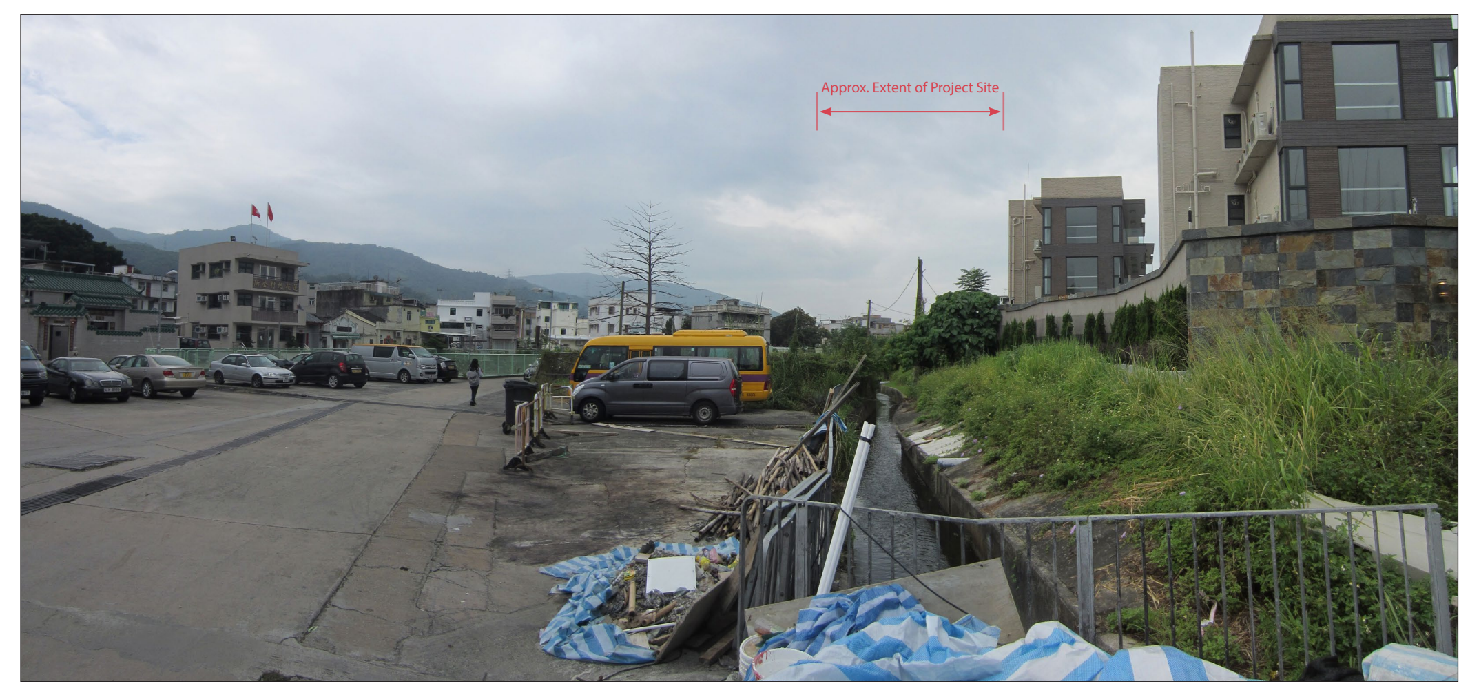
LFT-VSR3: Residents and pedestrians at Lin Fa Tei Village Gateway