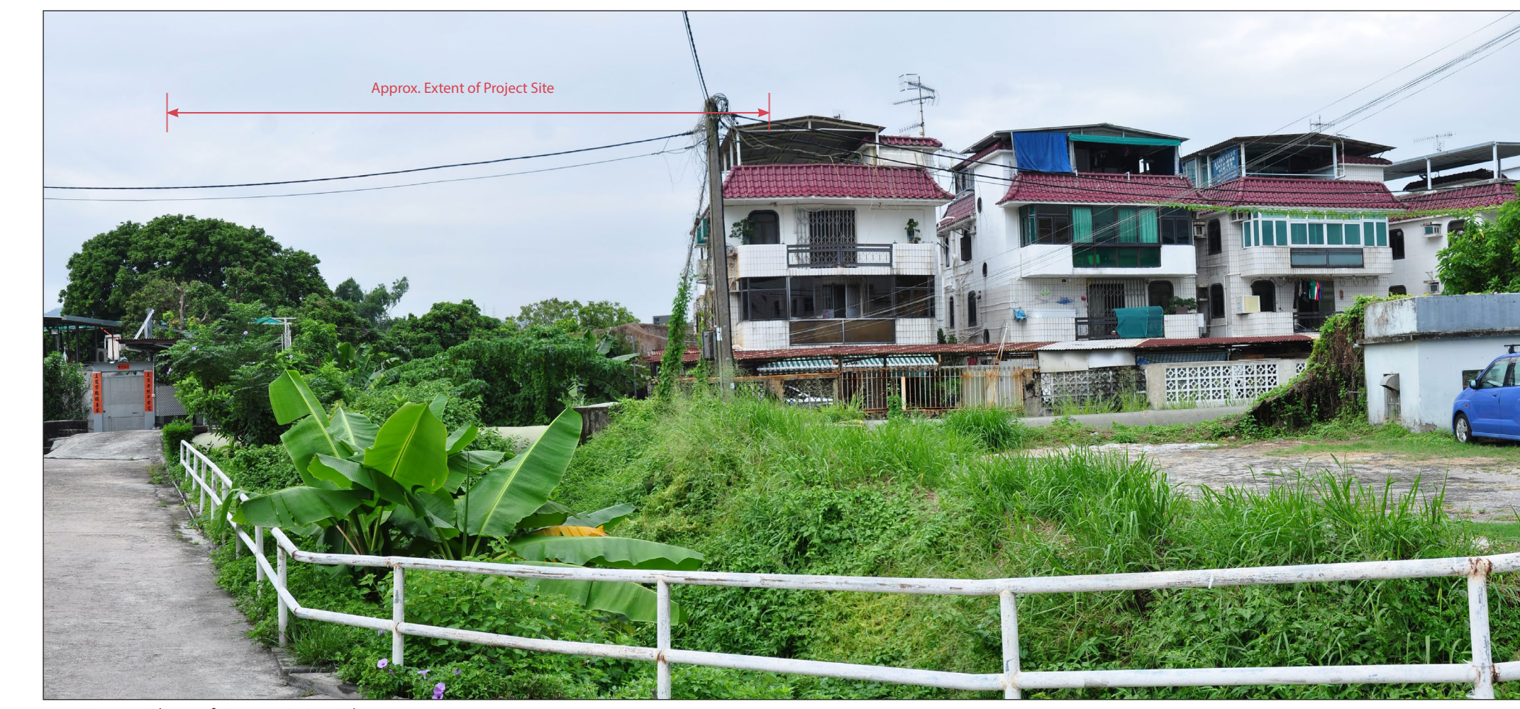
LFT-VSR5: Residents of Lin Fa Tei Riverside