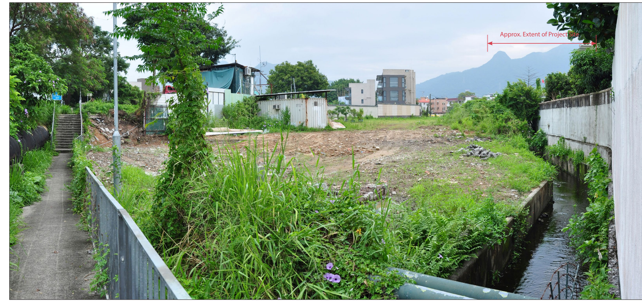
LFT-VSR2: Pedestrians on Footpath between Lin Fa Tei and Kam Sheung Road