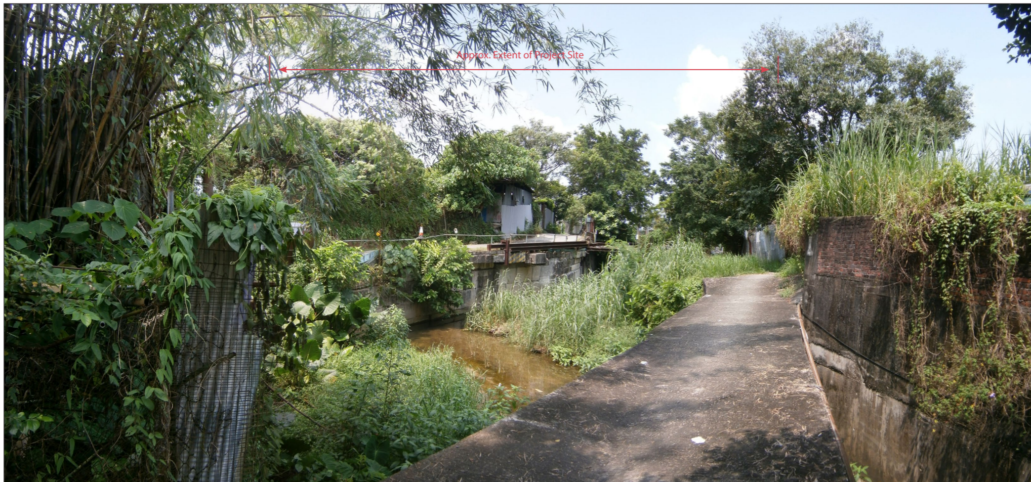
SSNV-VSR2: Pedestrians using channel footbridge