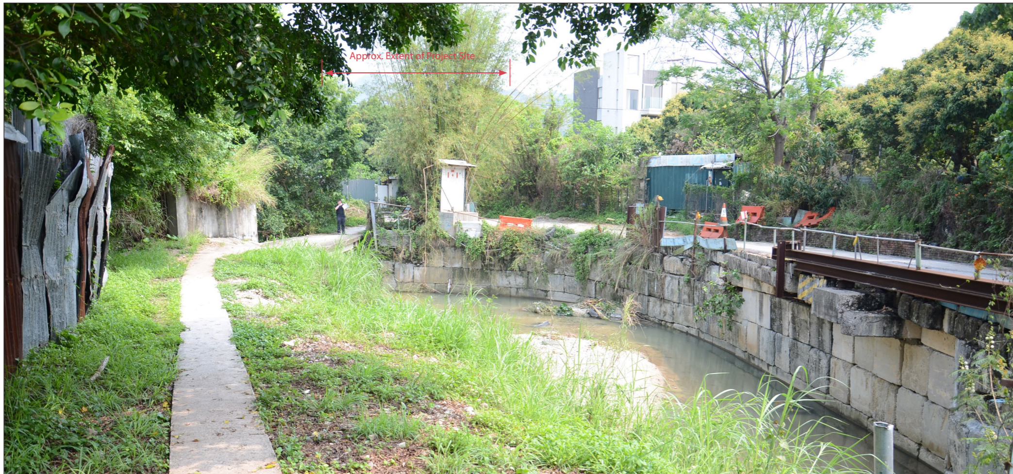
SSNV-VSR1: Vehicle travellers and pedestrians on road south of Tong Tau Po Tsuen village