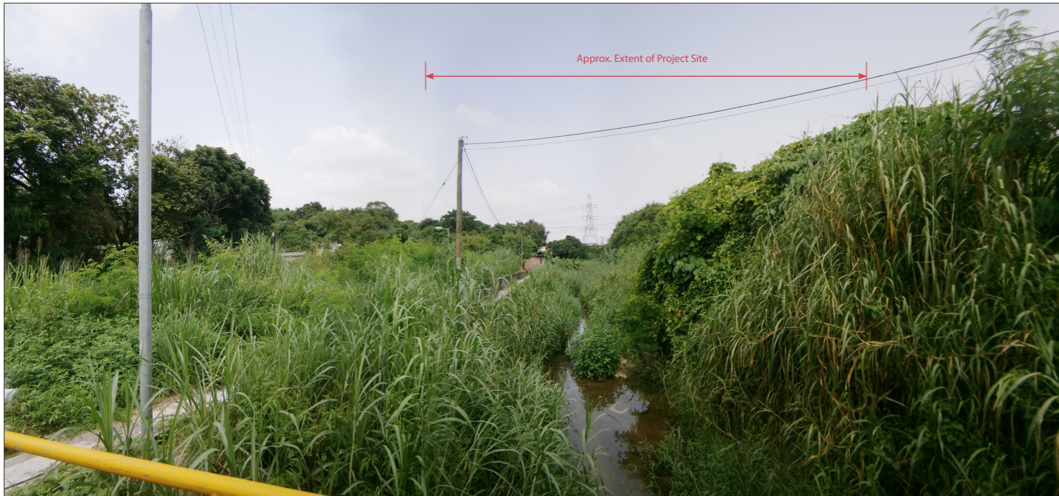
SSNV-VSR7: Pedestrians on footbridge crossing from Sung Shan New Village