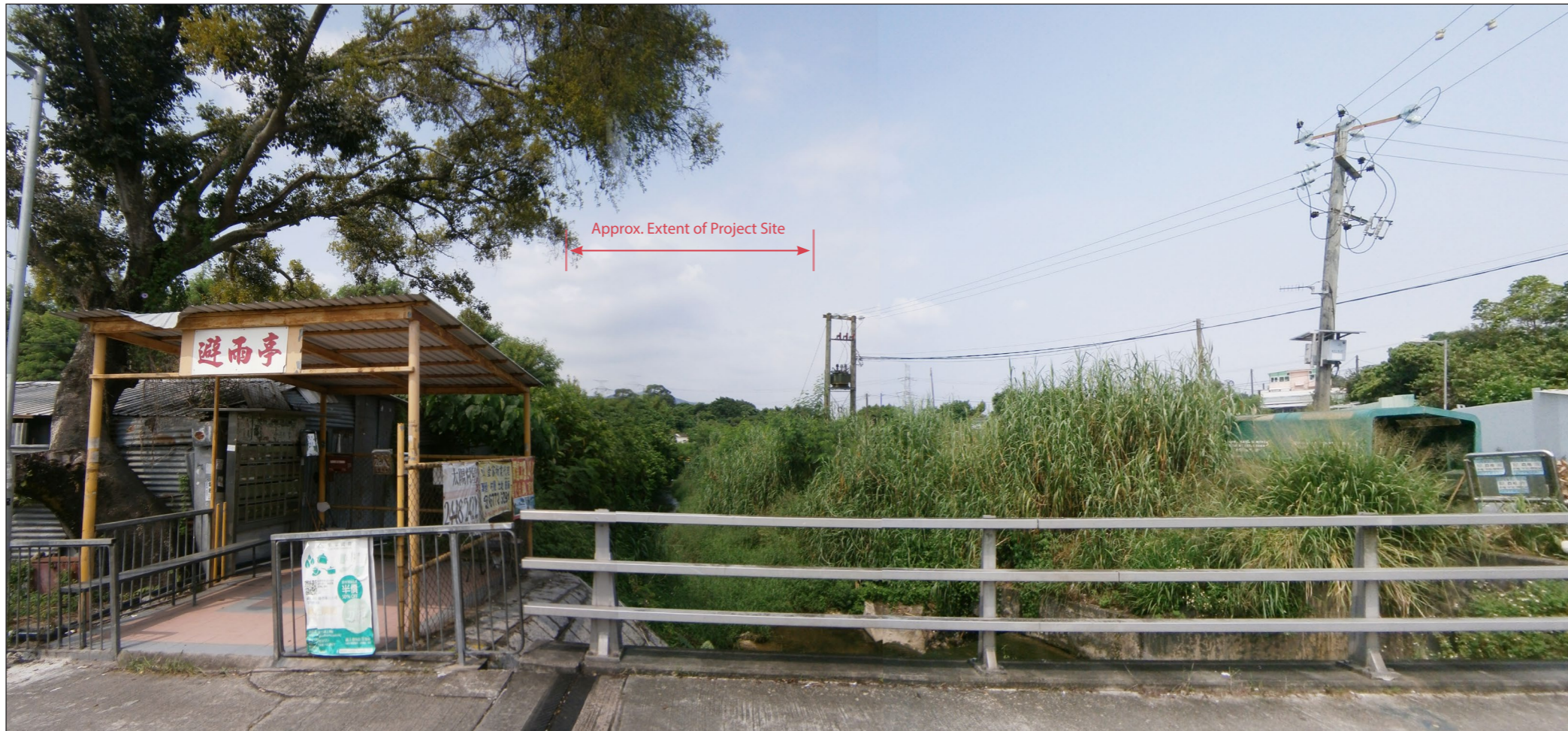
SSNV-VSR8: Vehicle travellers and pedestrians on channel bridge crossing