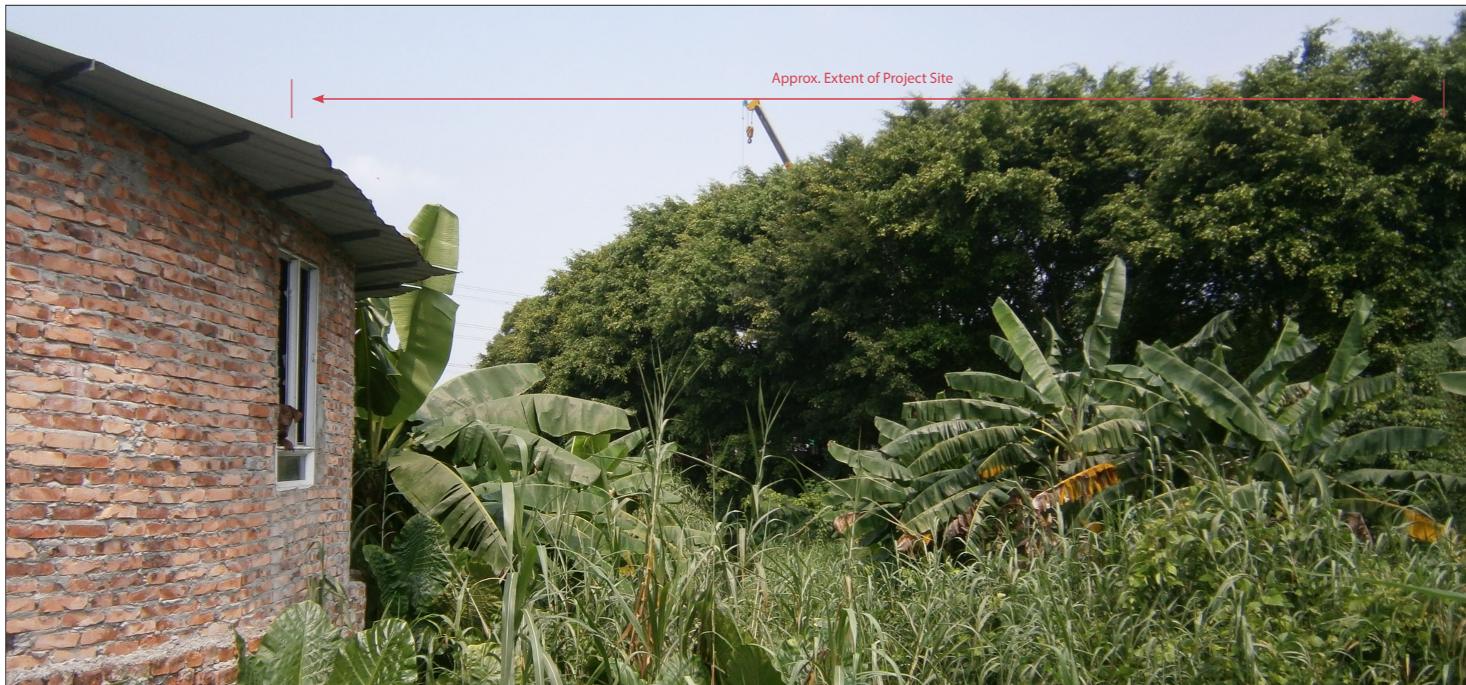
SSNV-VSR6: Smallholdings south of existing channel

User name: $USERNAME Date: $DATE Time: $TIME Filename: $FILES