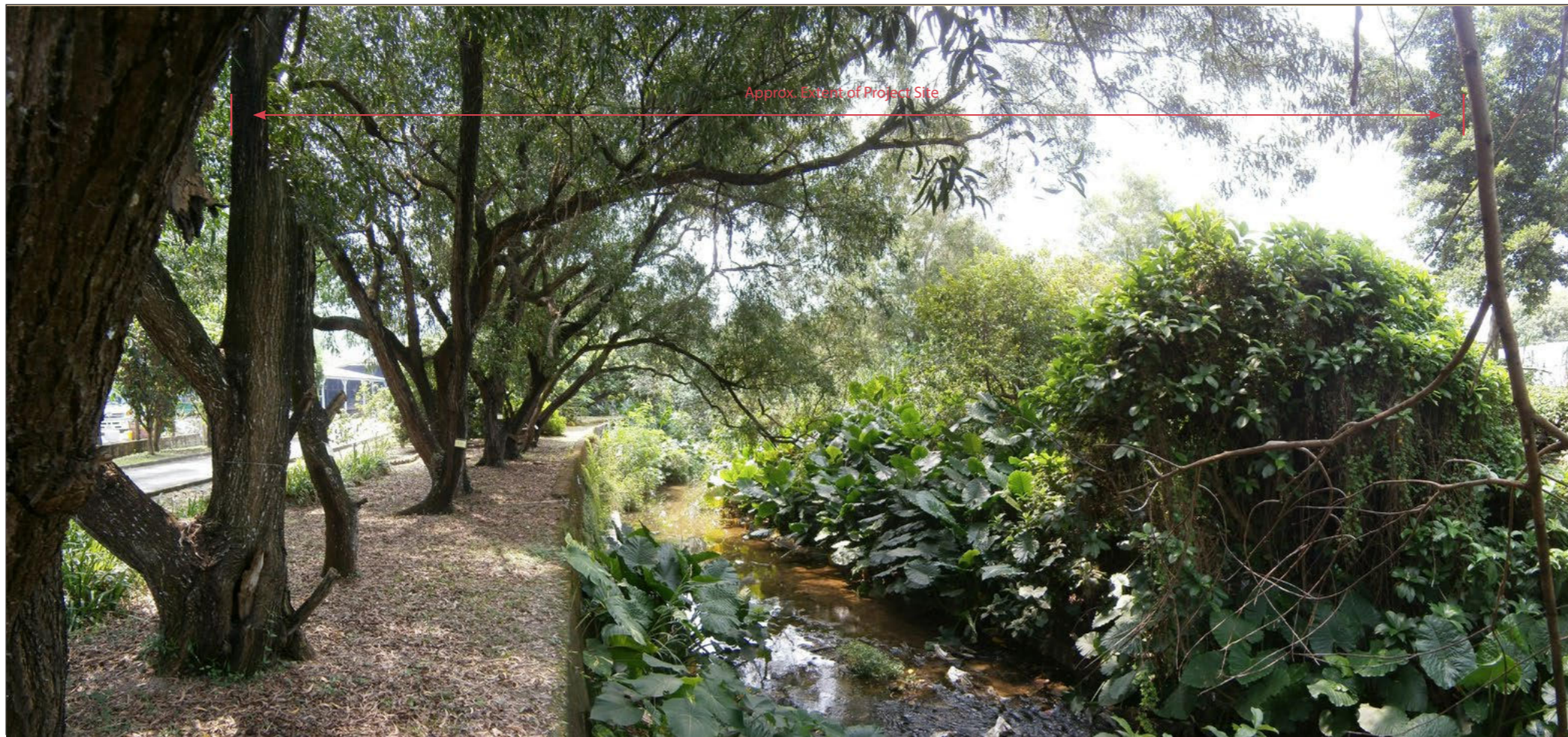
SSNV-VSR5: Vehicle travellers on Sung Shan New Village access road