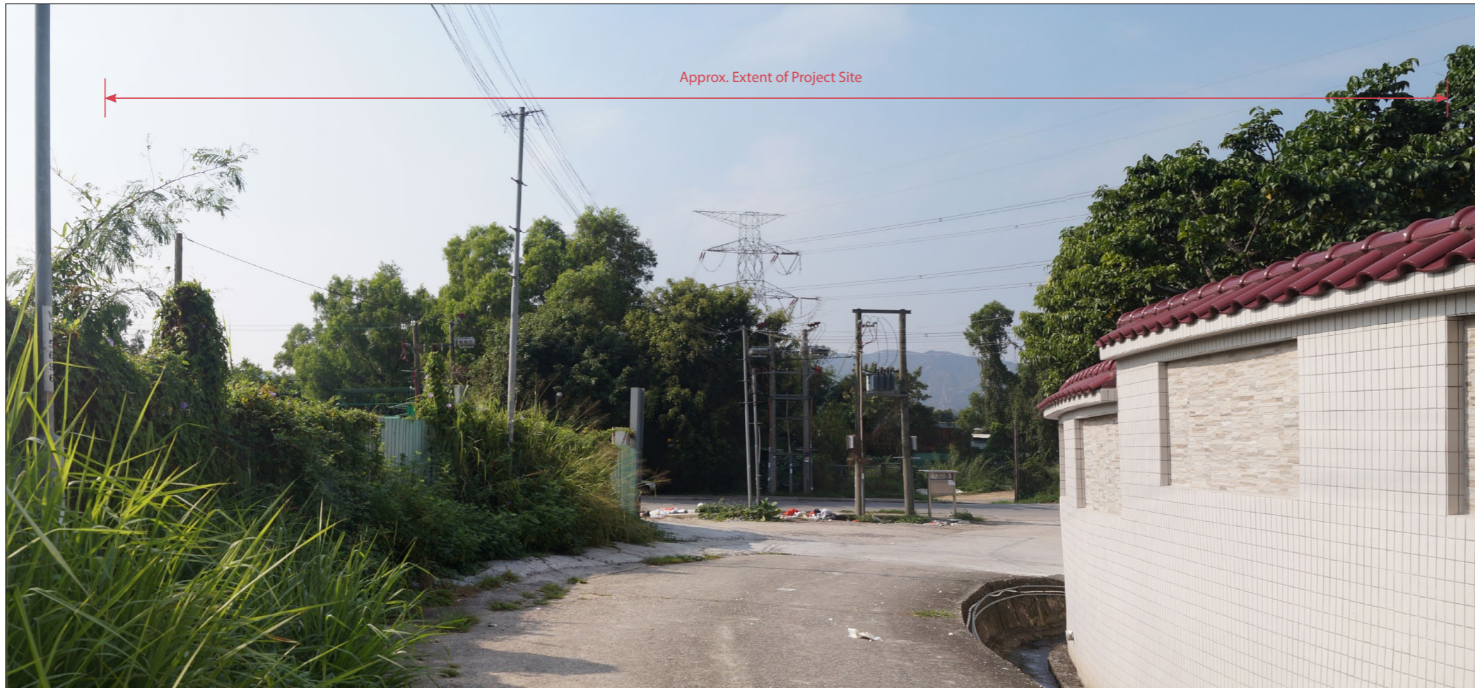
SSNV-VSR4: Residents of properties along Sung Shan New Village access road