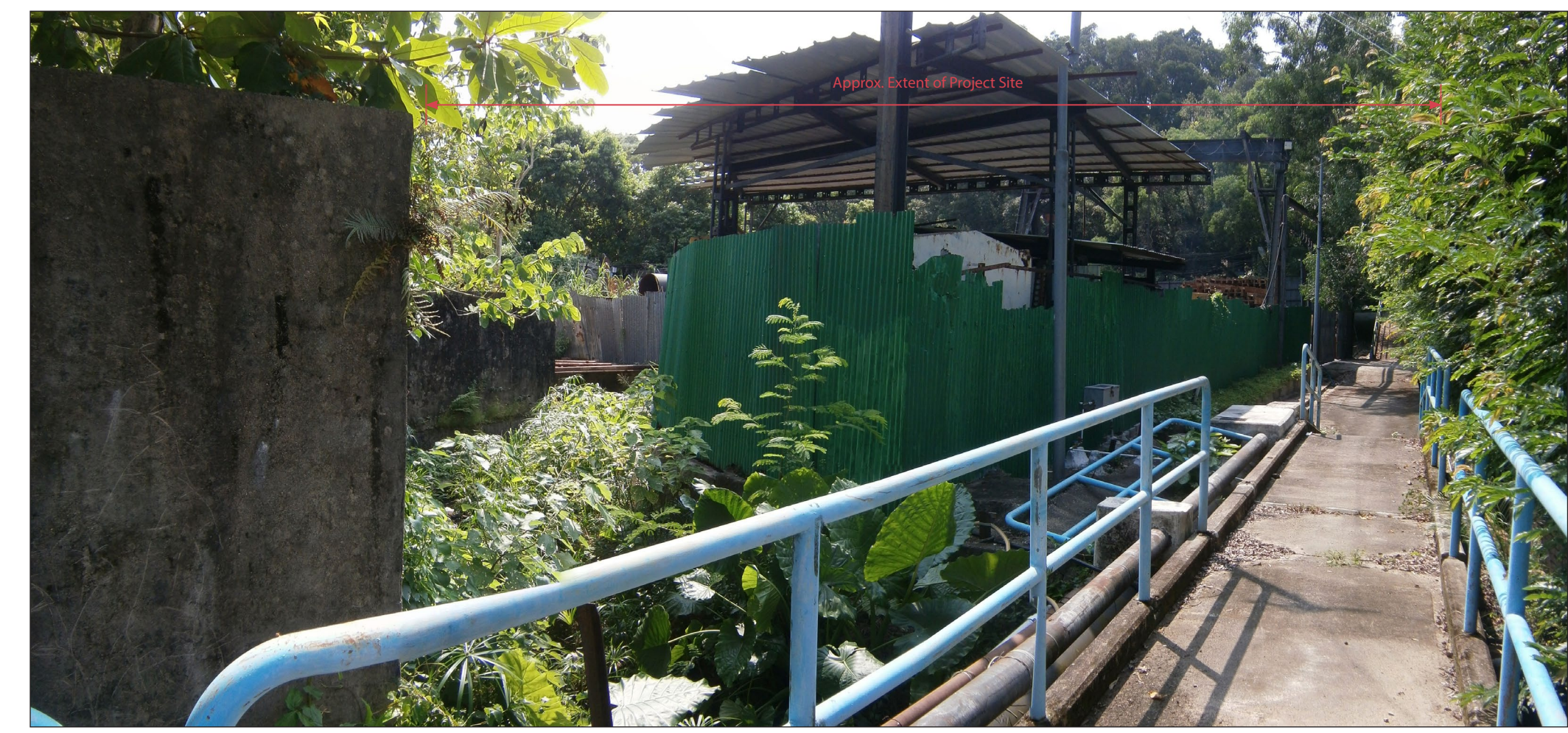
HC-VSR1: Pedestrians on industrial area access road