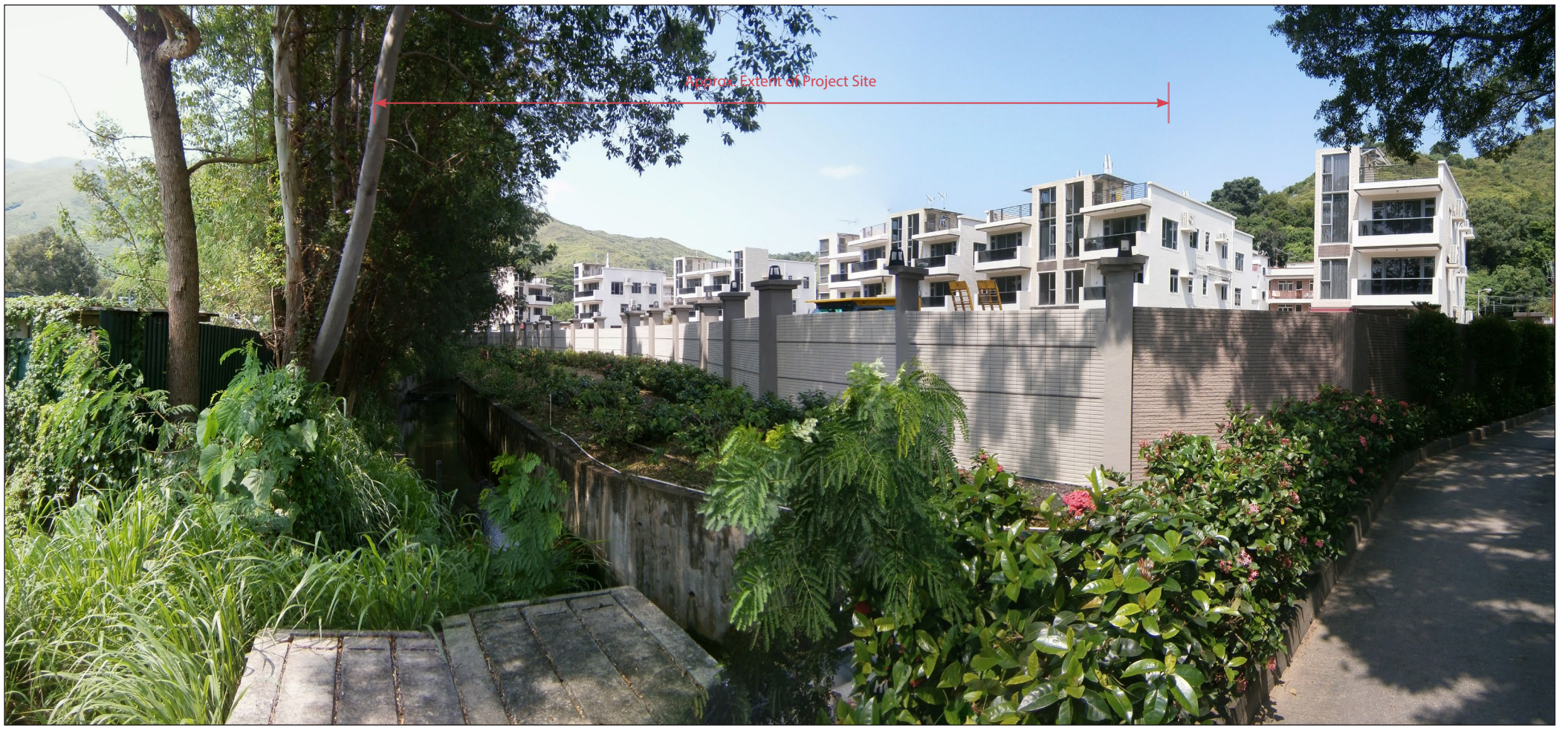
HC-VSR5: Vehicle travellers and pedestrians on Shui Kan Shek access road