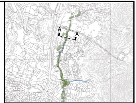
KEY PLAN N.T.S.