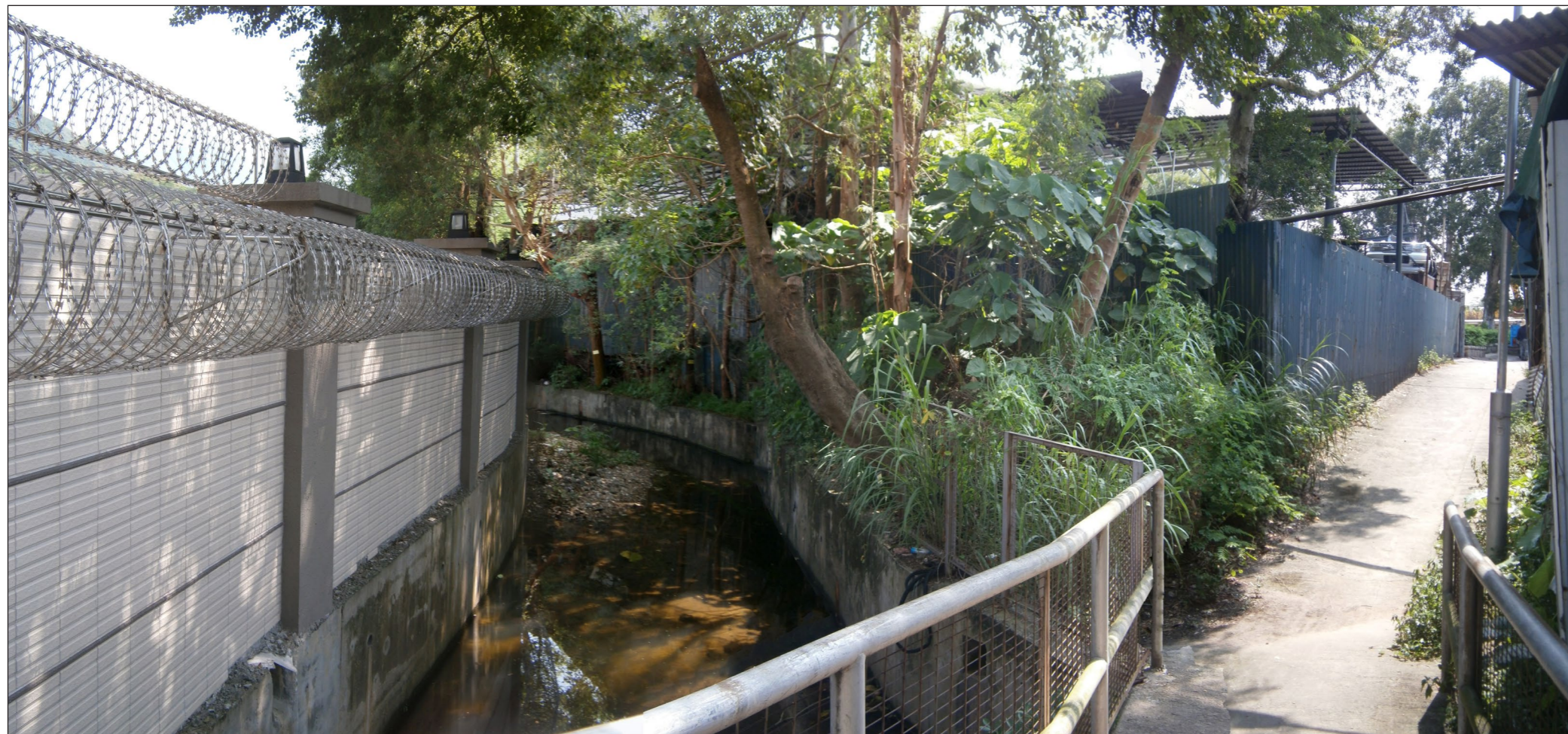
Vantage Point 1: Pedestrians on footpath from Kam Sheung Road to Shui Kan Shek (VSR 3) (Existing Situation)