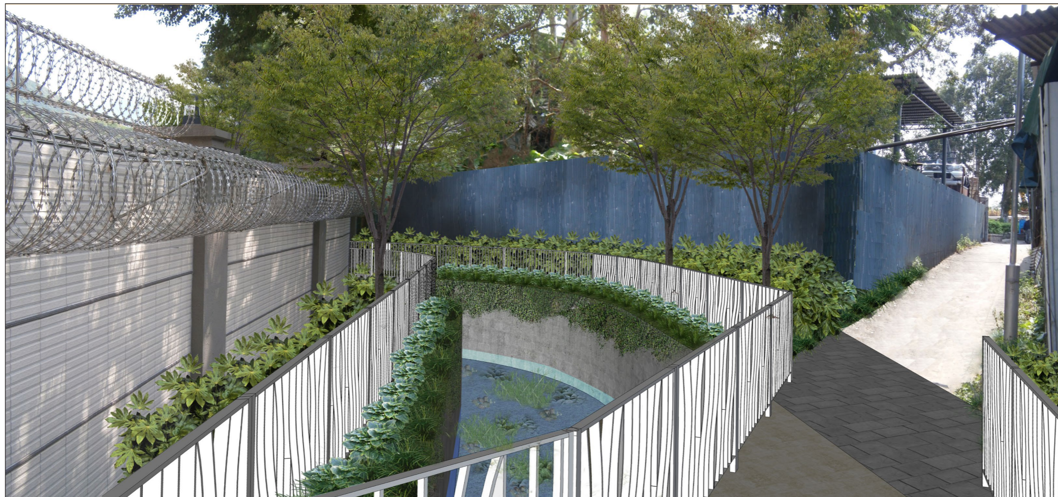
Vantage Point 1: Pedestrians on footpath from Kam Sheung Road to Shui Kan Shek (VSR 3) (With Mitigation) (Day One)