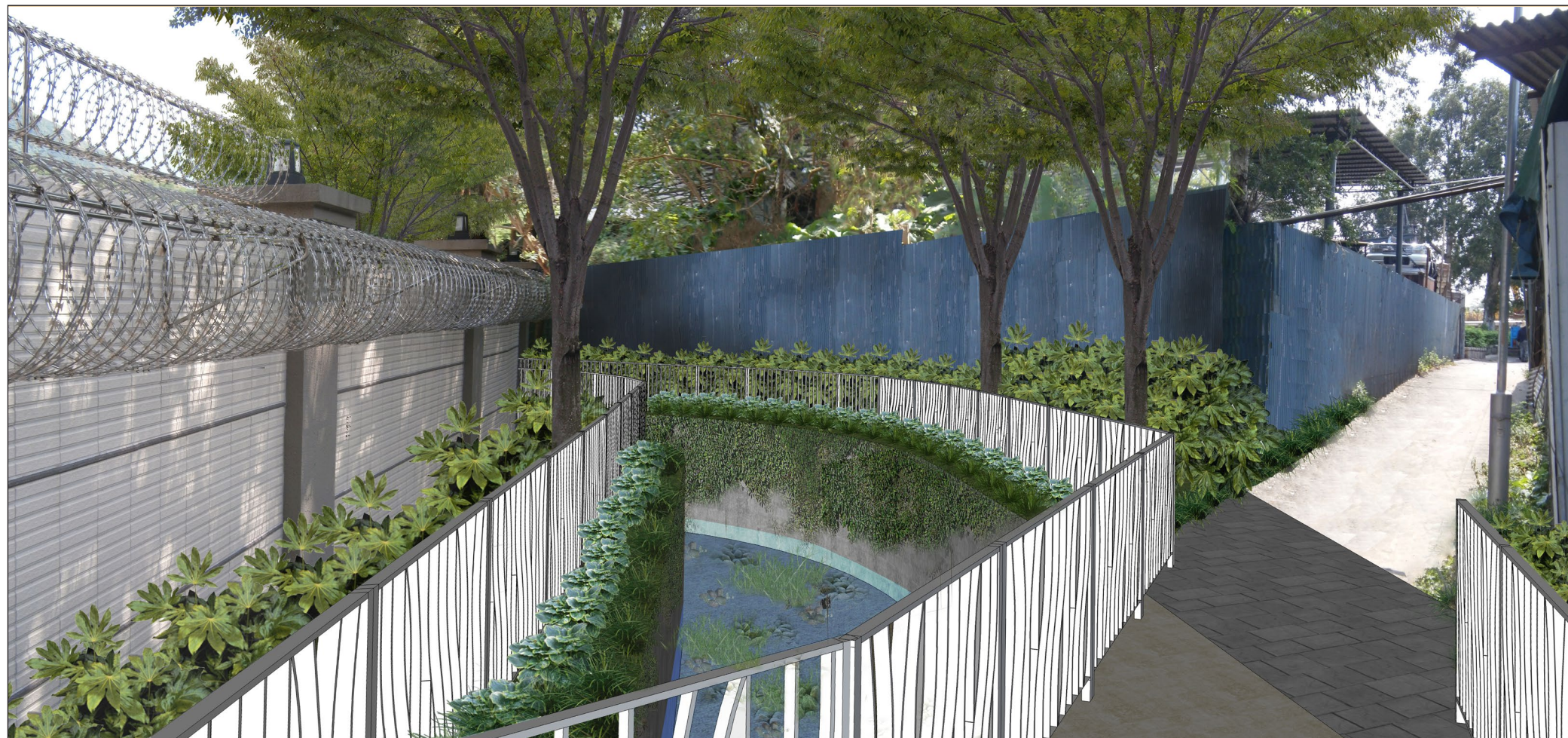
Vantage Point 1: Pedestrians on footpath from Kam Sheung Road to Shui Kan Shek (VSR 3) (With Mitigation) (Year Ten)