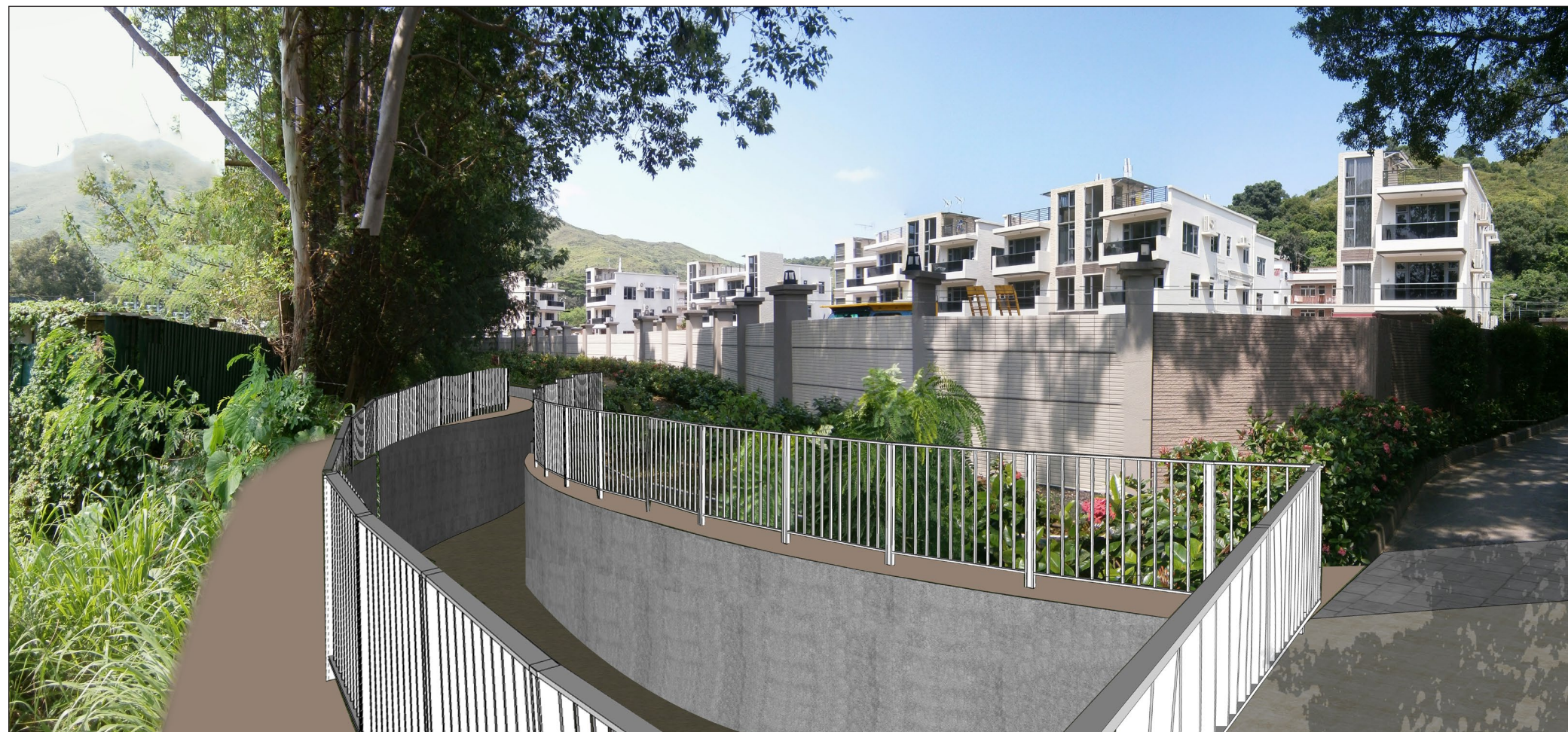
Vantage Point 2: Vehicle travellers and pedestrians on Shui Kan Shek access road (VSR 5) (Without Mitigation)