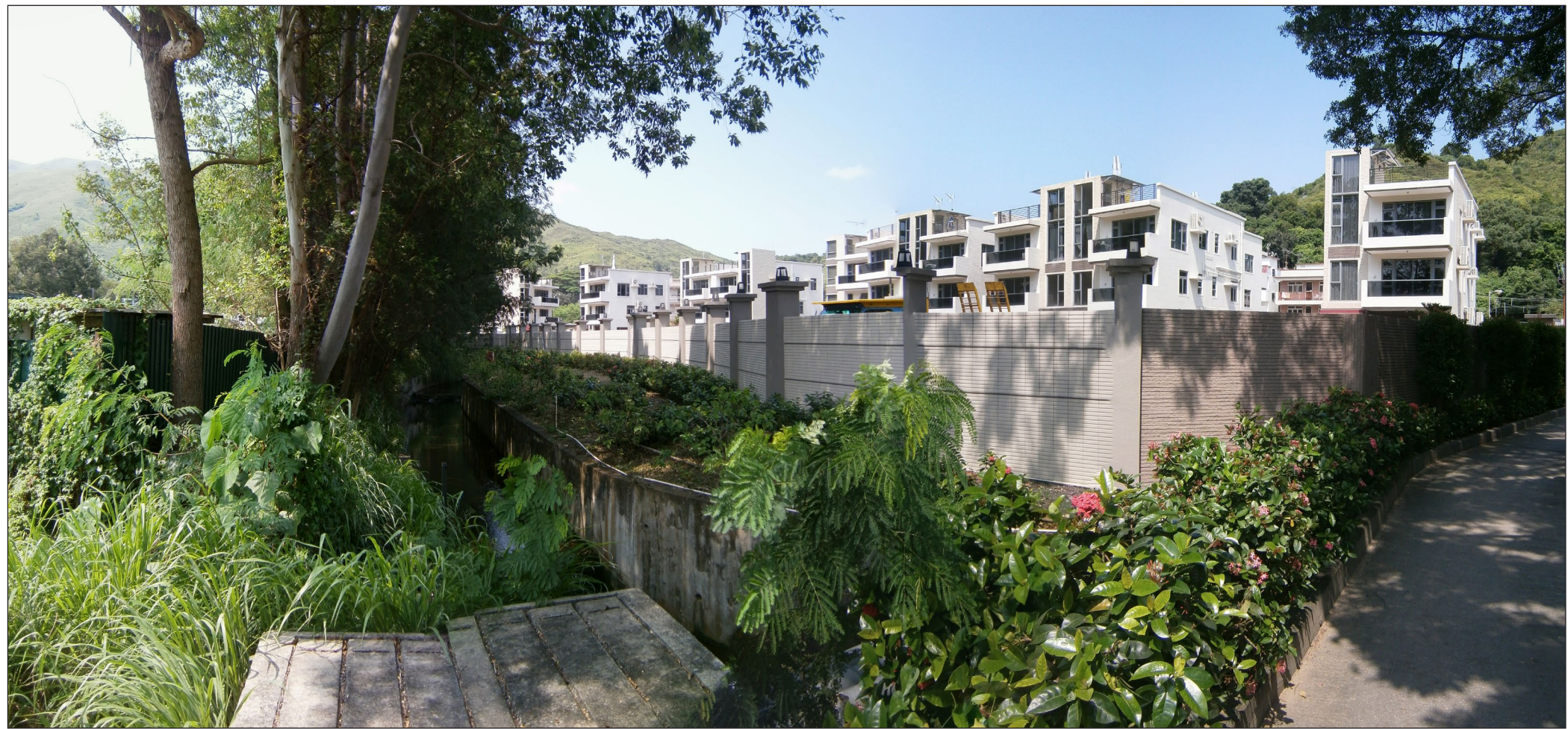
Vantage Point 2: Vehicle travellers and pedestrians on Shui Kan Shek access road (VSR 5) (Existing Situation)