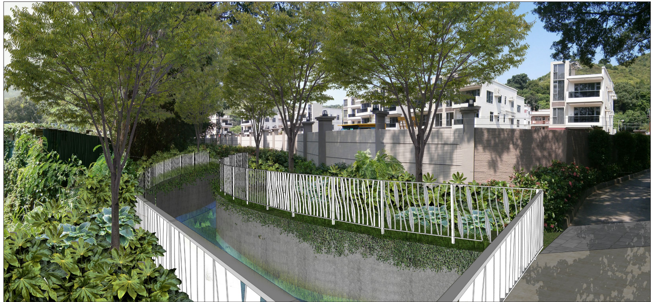
Vantage Point 2: Vehicle travellers and pedestrians on Shui Kan Shek access road (VSR 5) (With Mitigation) (Day One)