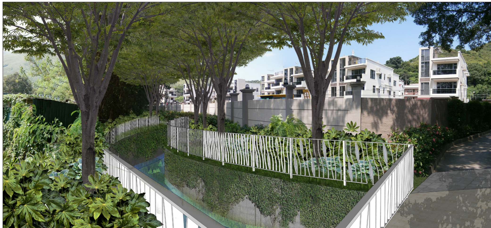
Vantage Point 2: Vehicle travellers and pedestrians on Shui Kan Shek access road (VSR 5) (With Mitigation) (Year Ten)