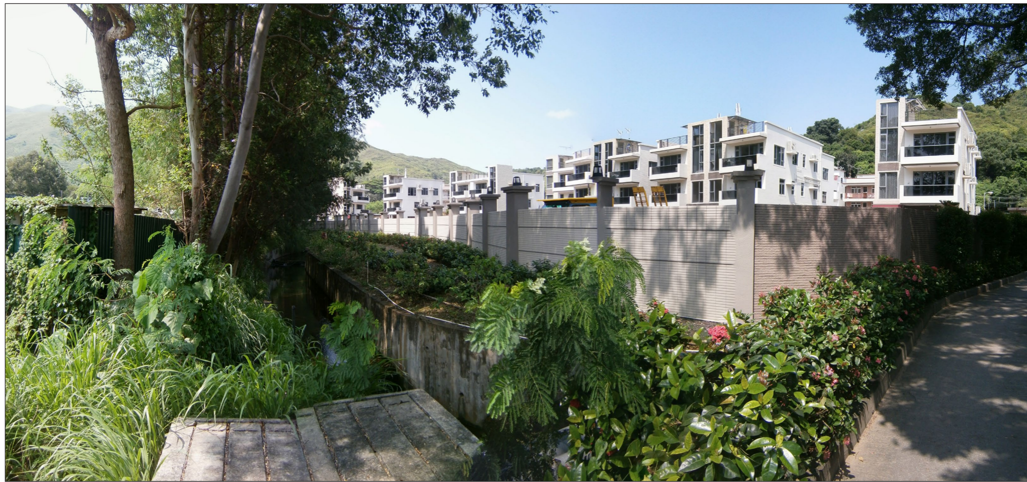
Vantage Point 2: Vehicle travellers and pedestrians on Shui Kan Shek access road (VSR 5) (Existing Situation)