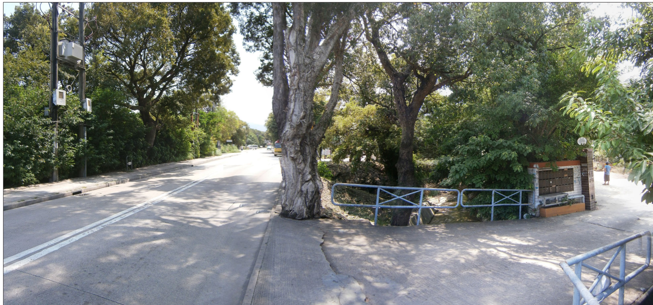
Vantage Point 3: Vehicle travellers and pedestrians on Fan Kam Road (VSR 7) (Existing Situation)