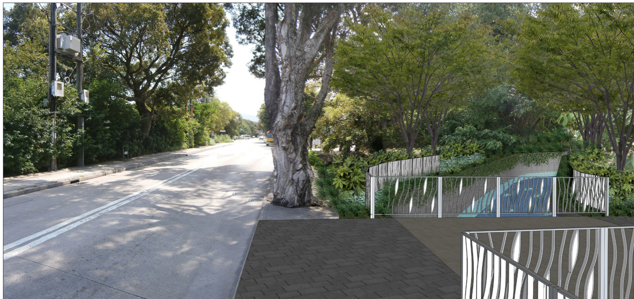
Vantage Point 3: Vehicle travellers and pedestrians on Fan Kam Road (VSR 7) (With Mitigation) (Day One)