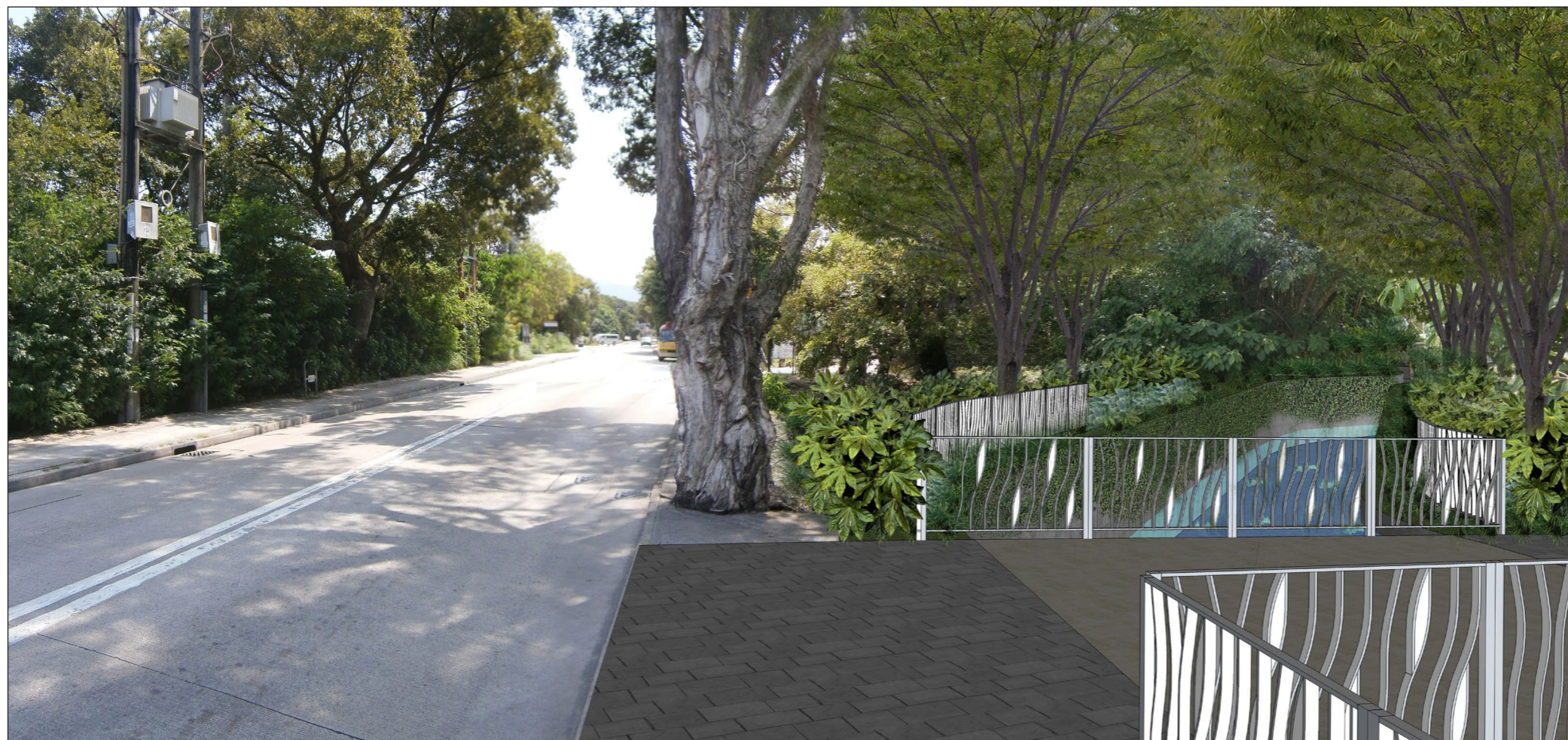
Vantage Point 3: Vehicle travellers and pedestrians on Fan Kam Road (VSR 7) (With Mitigation) (Year Ten)