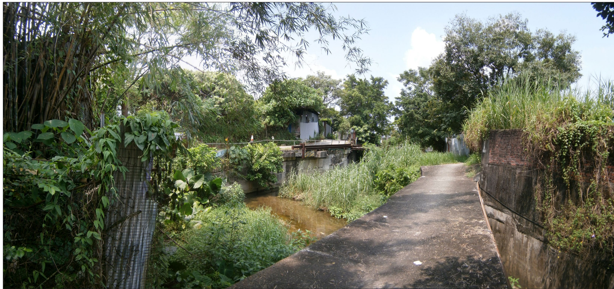
Vantage Point 1: Pedestrians using channel footbridge (VSR 2) (Existing Situation)