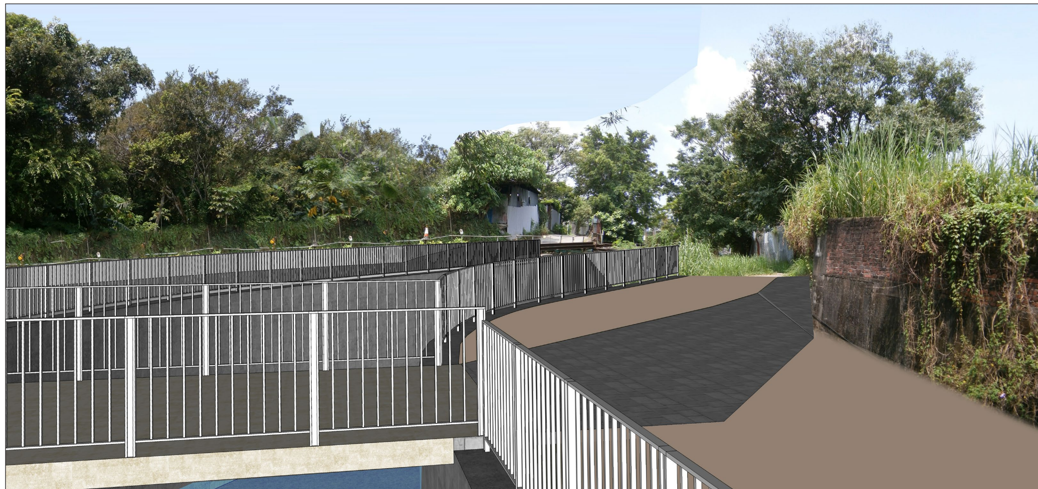
Vantage Point 1: Pedestrians using channel footbridge (VSR 2) (Without Mitigation)