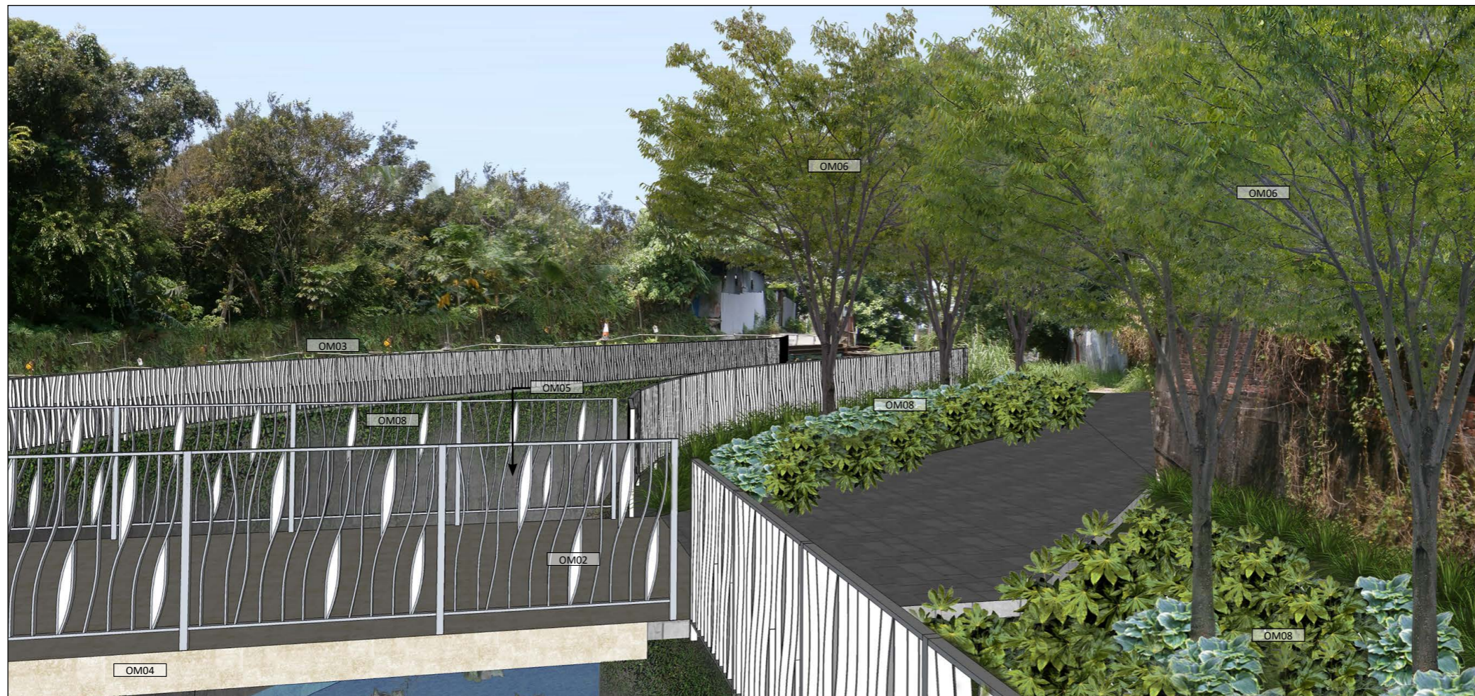
Vantage Point 1: Pedestrians using channel footbridge (VSR 2) (With Mitigation) (Day One)