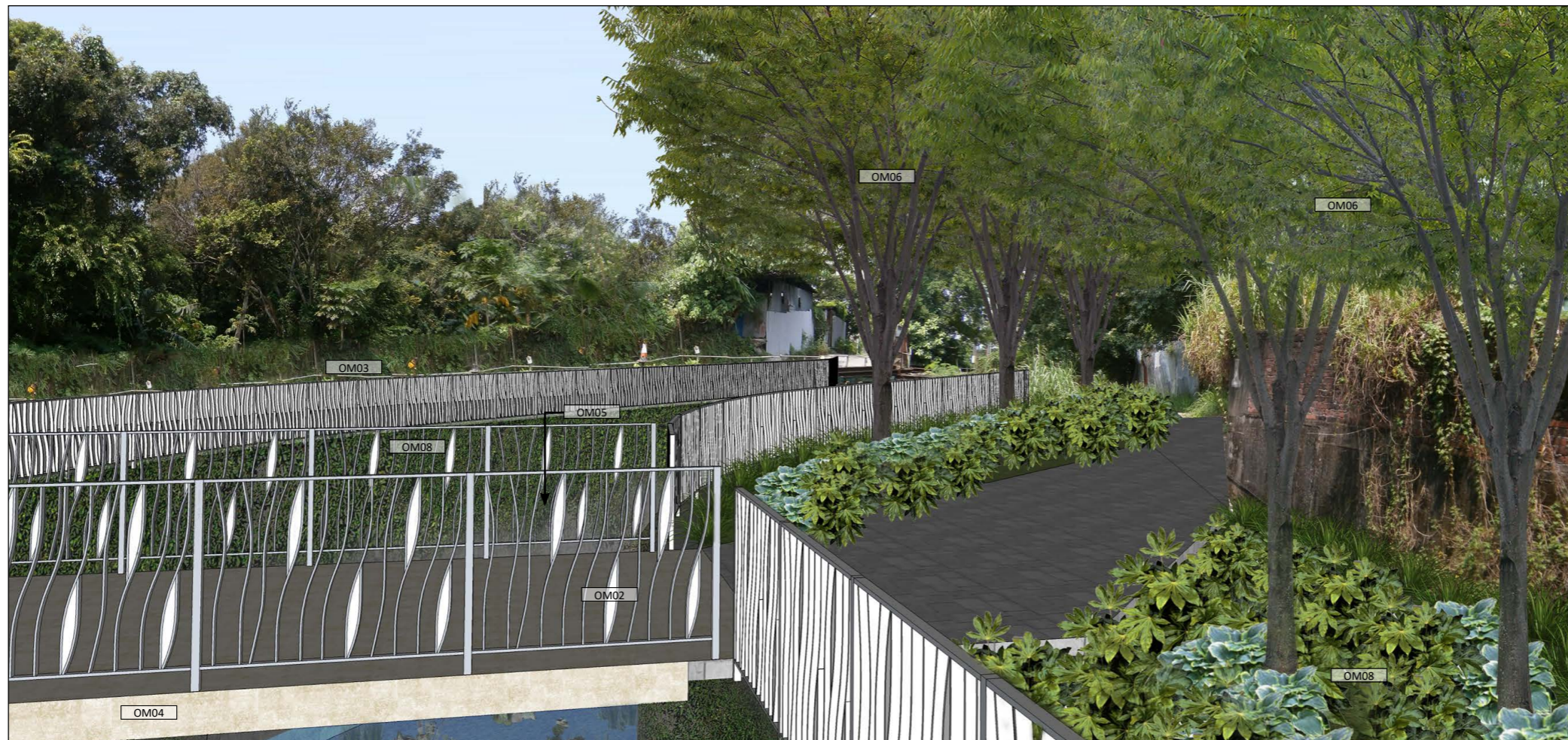
Vantage Point 1: Pedestrians using channel footbridge (VSR 2) (With Mitigation) (Year Ten)