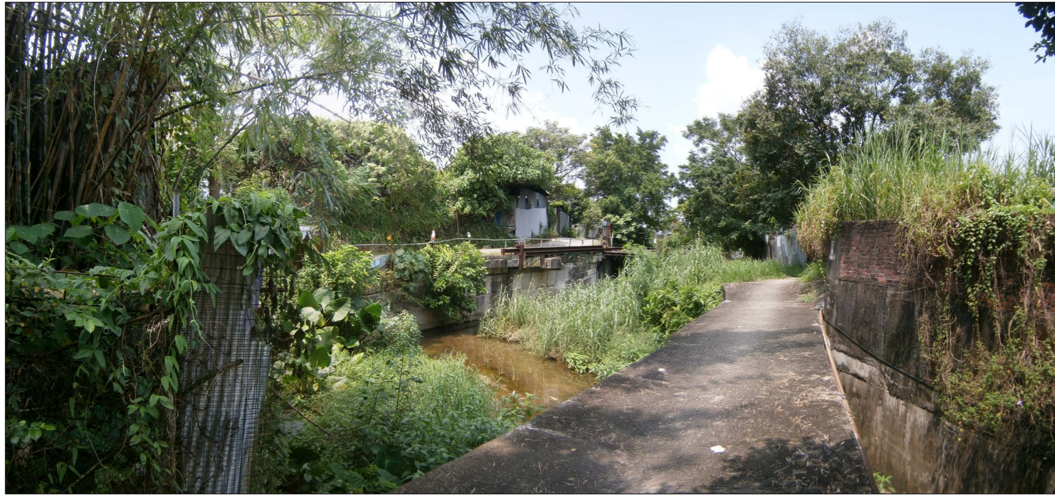
Vantage Point 1: Pedestrians using channel footbridge (VSR 2) (Existing Situation)