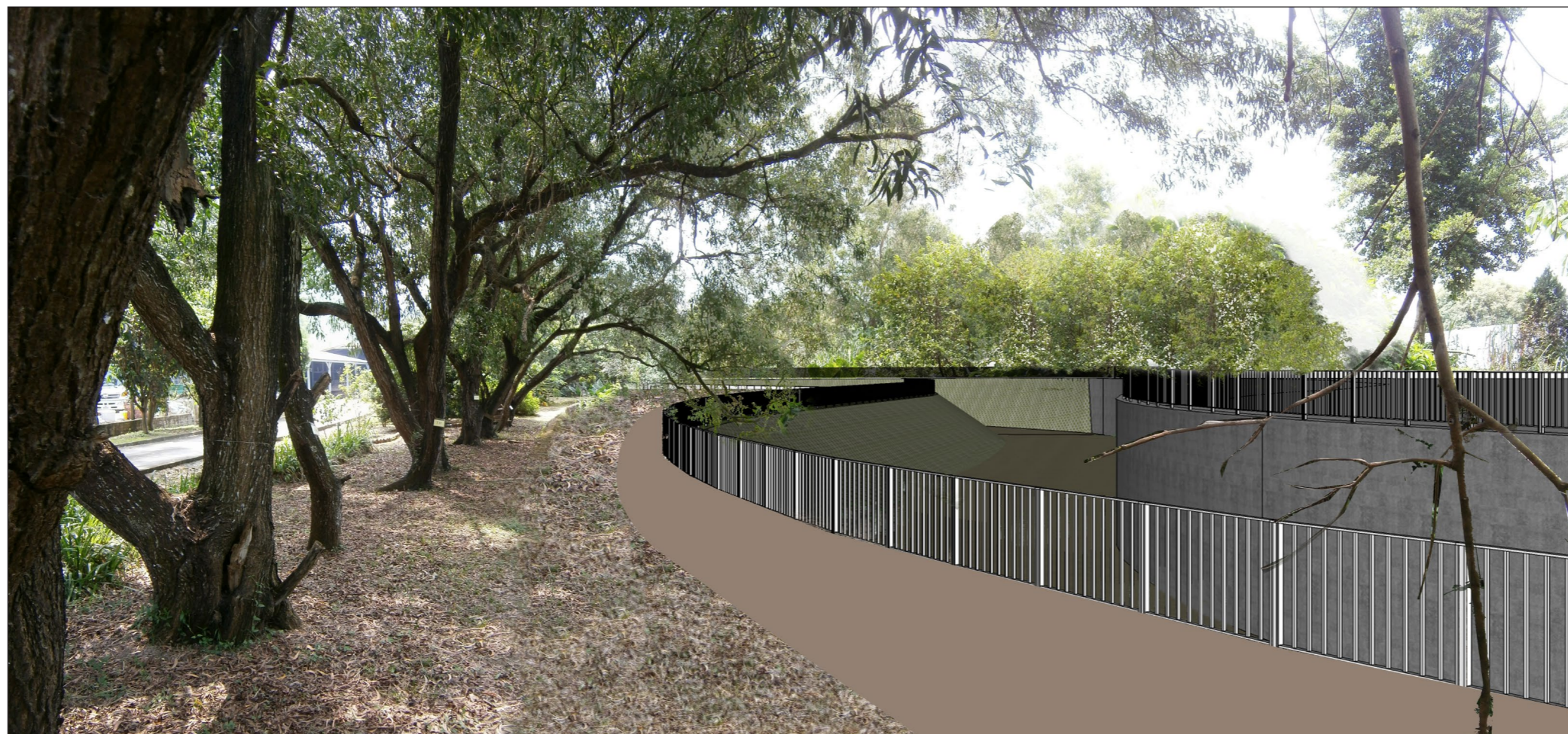
Vantage Point 2: Vehicle travellers on Sung Shan New Village access road (VSR 5) (Without Mitigation)