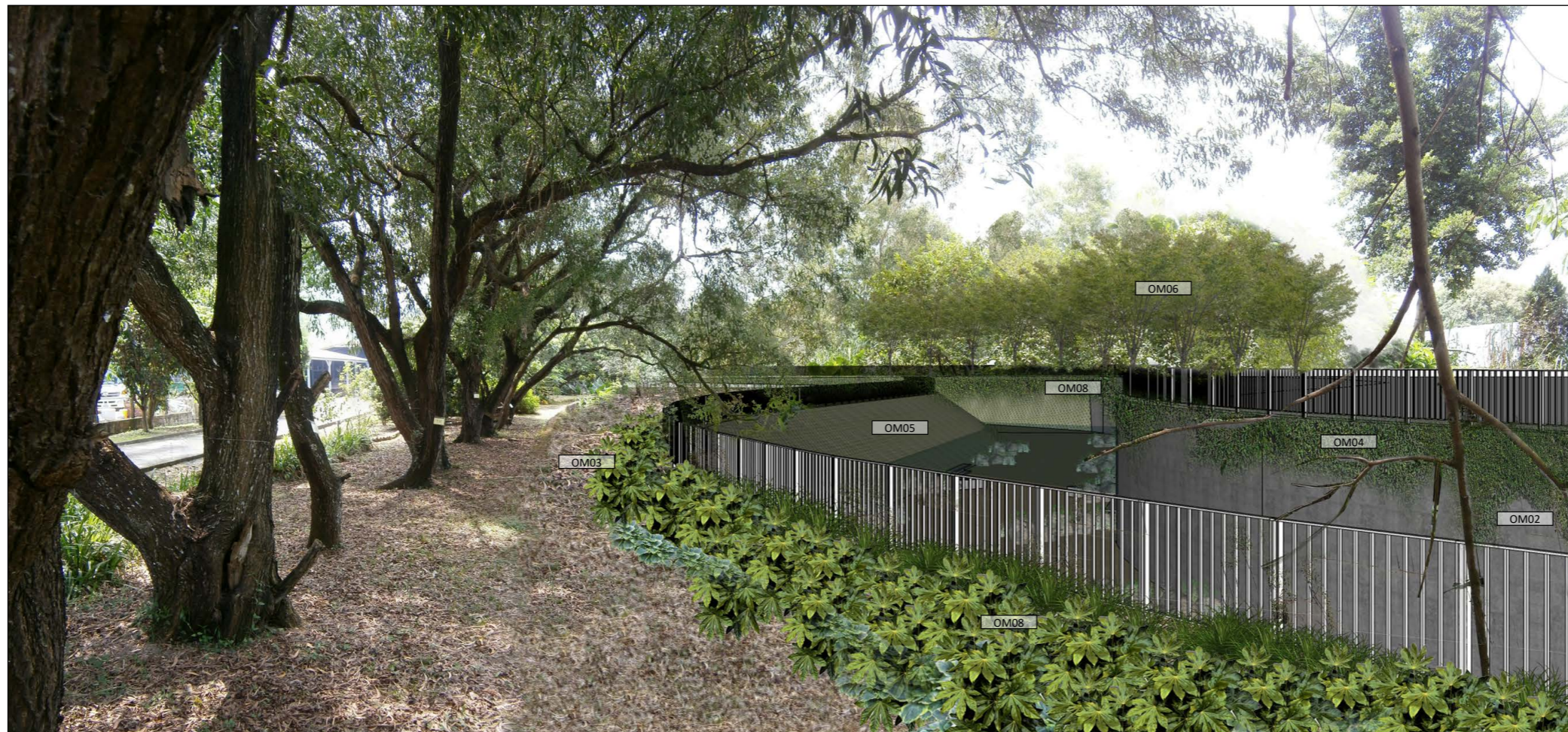
Vantage Point 2: Vehicle travellers on Sung Shan New Village access road (VSR 5) (With Mitigation) (Day One)