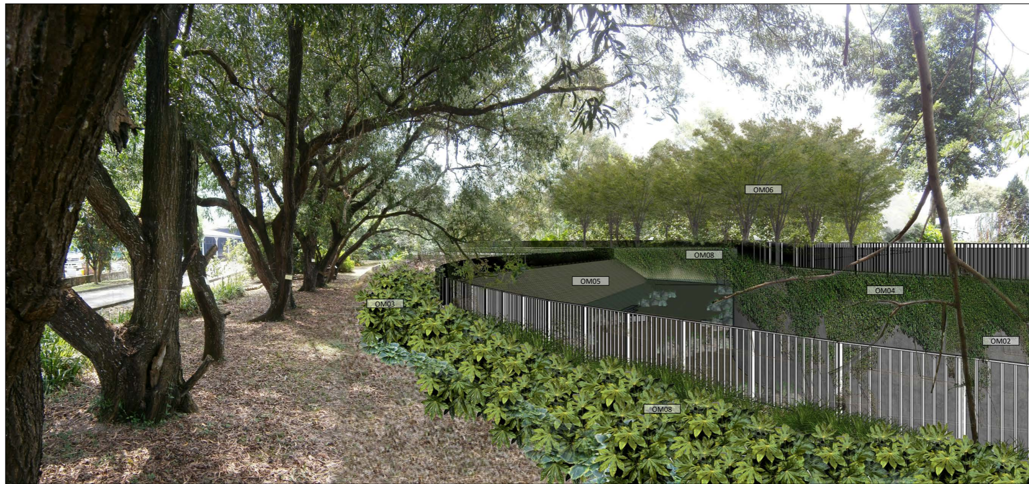
Vantage Point 2: Vehicle travellers on Sung Shan New Village access road (VSR 5) (With Mitigation) (Year Ten)