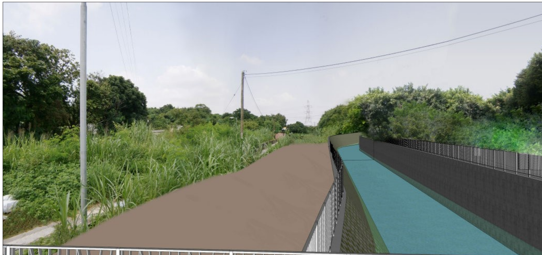
Vantage Point 3: Pedestrians on footbridge crossing from Sung Shan New Village (VSR 7) (Without Mitigation)