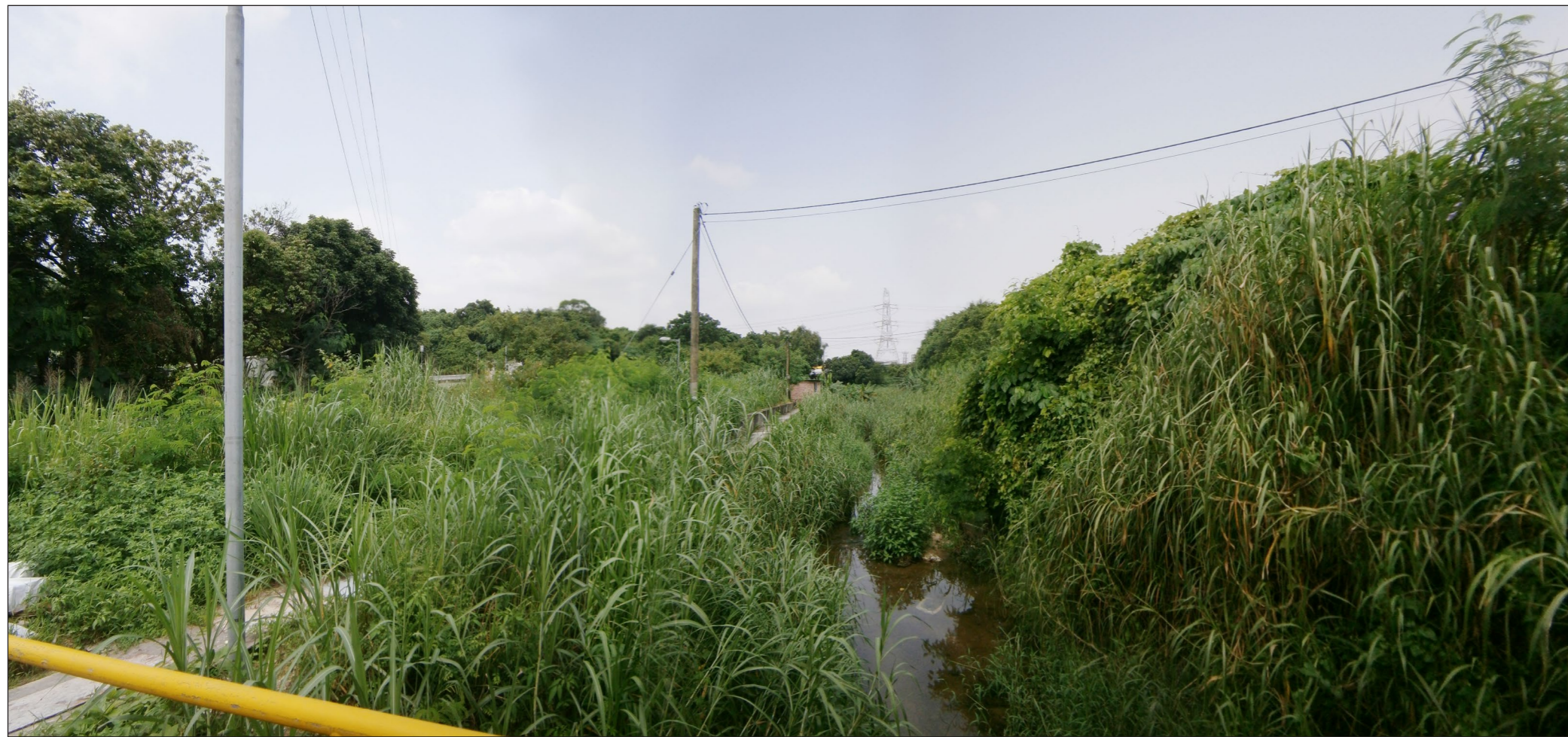
Vantage Point 3: Pedestrians on footbridge crossing from Sung Shan New Village (VSR 7) (Existing Situation)