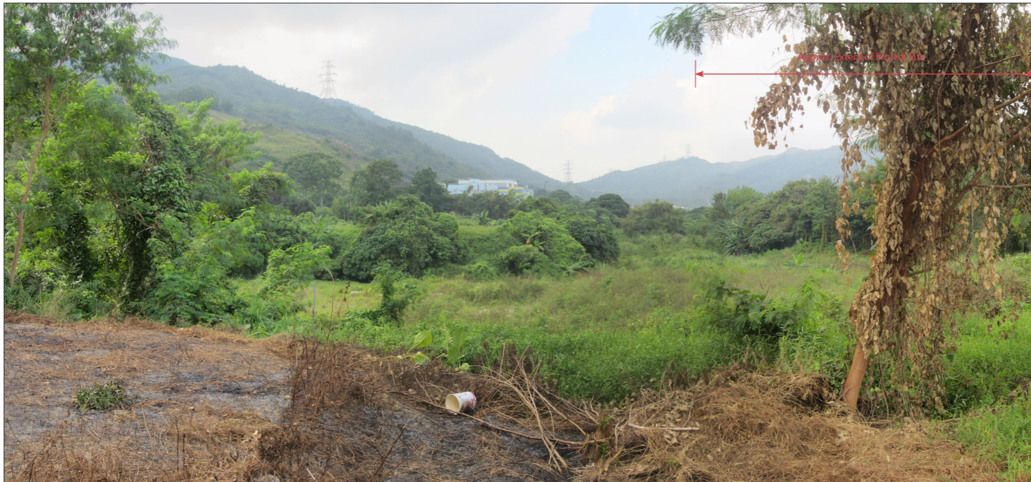
TW-VSR1: Residents of Tai Wo (south east)