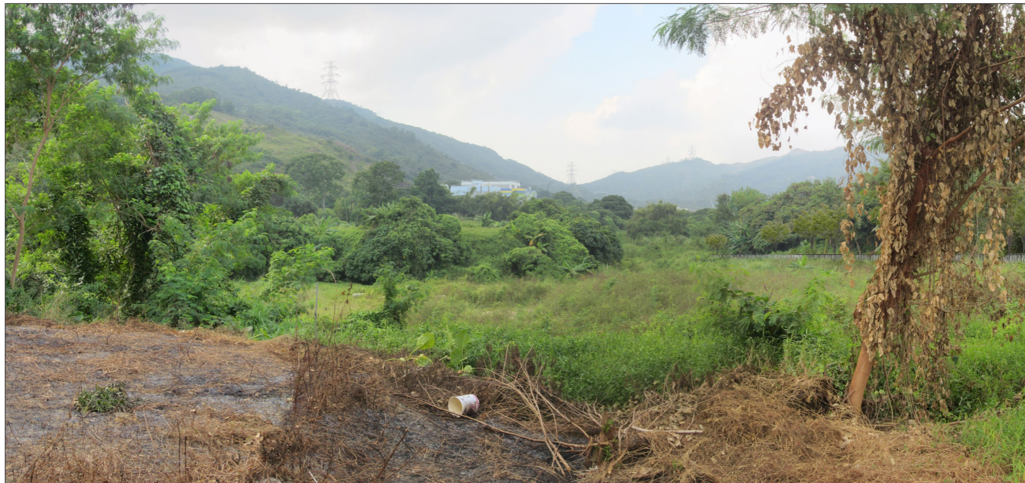
Vantage Point 1: Residents of Tai Wo (south east) (VSR 1) (With Mitigation) (Day One)