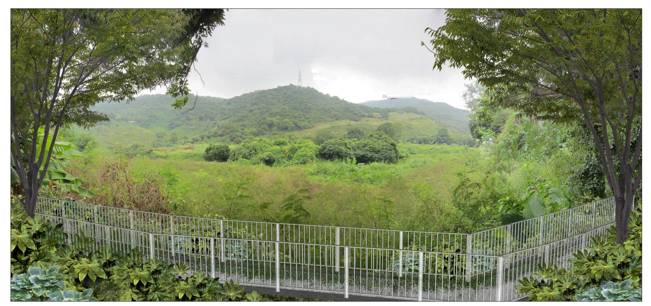
Vantage Point 2: Pedestrians on narrow footpath between Tai Wo and Cheung Po (VSR 5) (With Mitigation) (Day One)