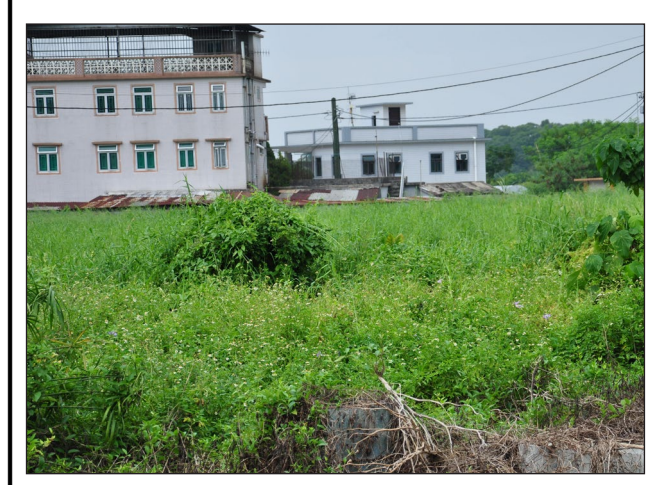
LFT-LR5: SEASONALLY WET GRASSLAND