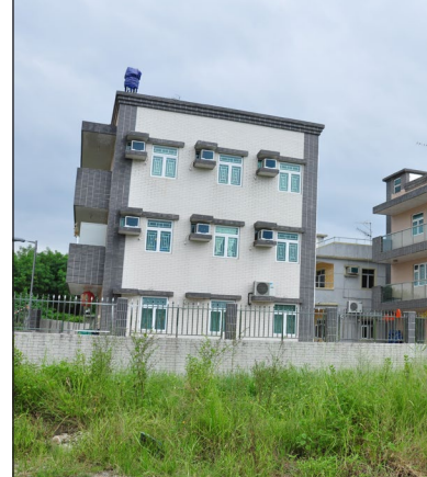
LFT-LR12: URBAN / RESIDENTIAL AREA