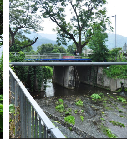
LFT-LR4: WATER COURSE