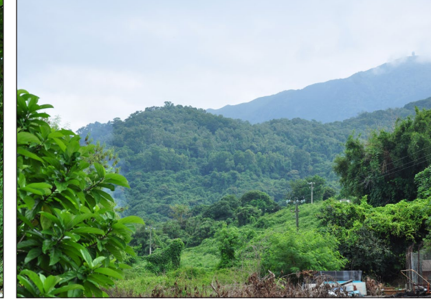
LFT-LR7: GRASSLAND / SHRUBLAND