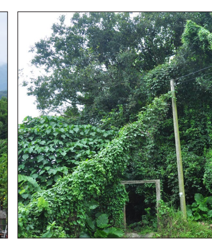
LFT-LR8: SECONDARY WOODLAND