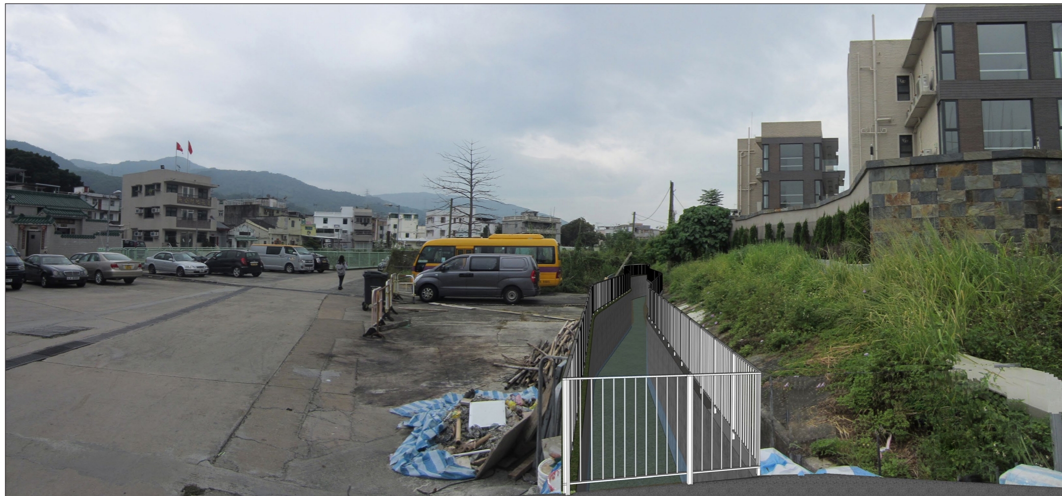
Vantage Point 1: Residents and pedestrians at Lin Fa Tei Village Gateway (VSR 3) (Without Mitigation)