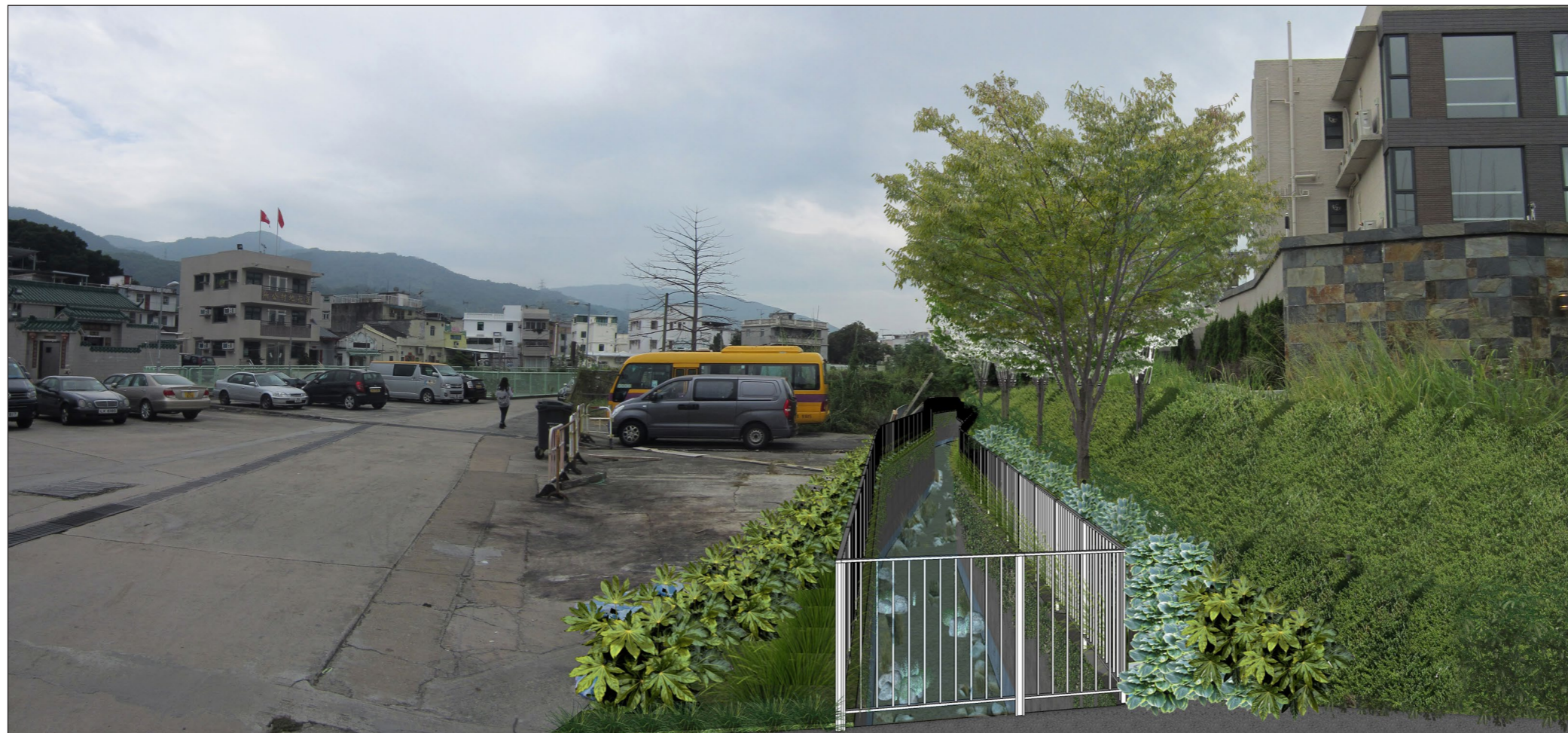
Vantage Point 1: Residents and pedestrians at Lin Fa Tei Village Gateway (VSR 3) (With Mitigation) (Day One)