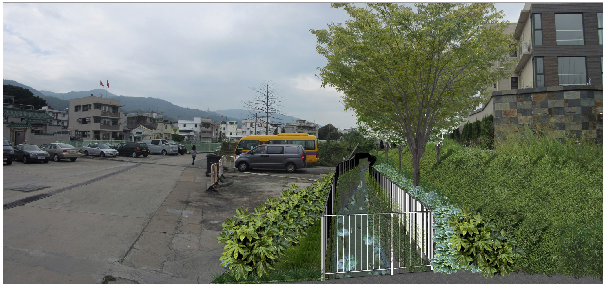
Vantage Point 1: Residents and pedestrians at Lin Fa Tei Village Gateway (VSR 3) (With Mitigation) (Year Ten)