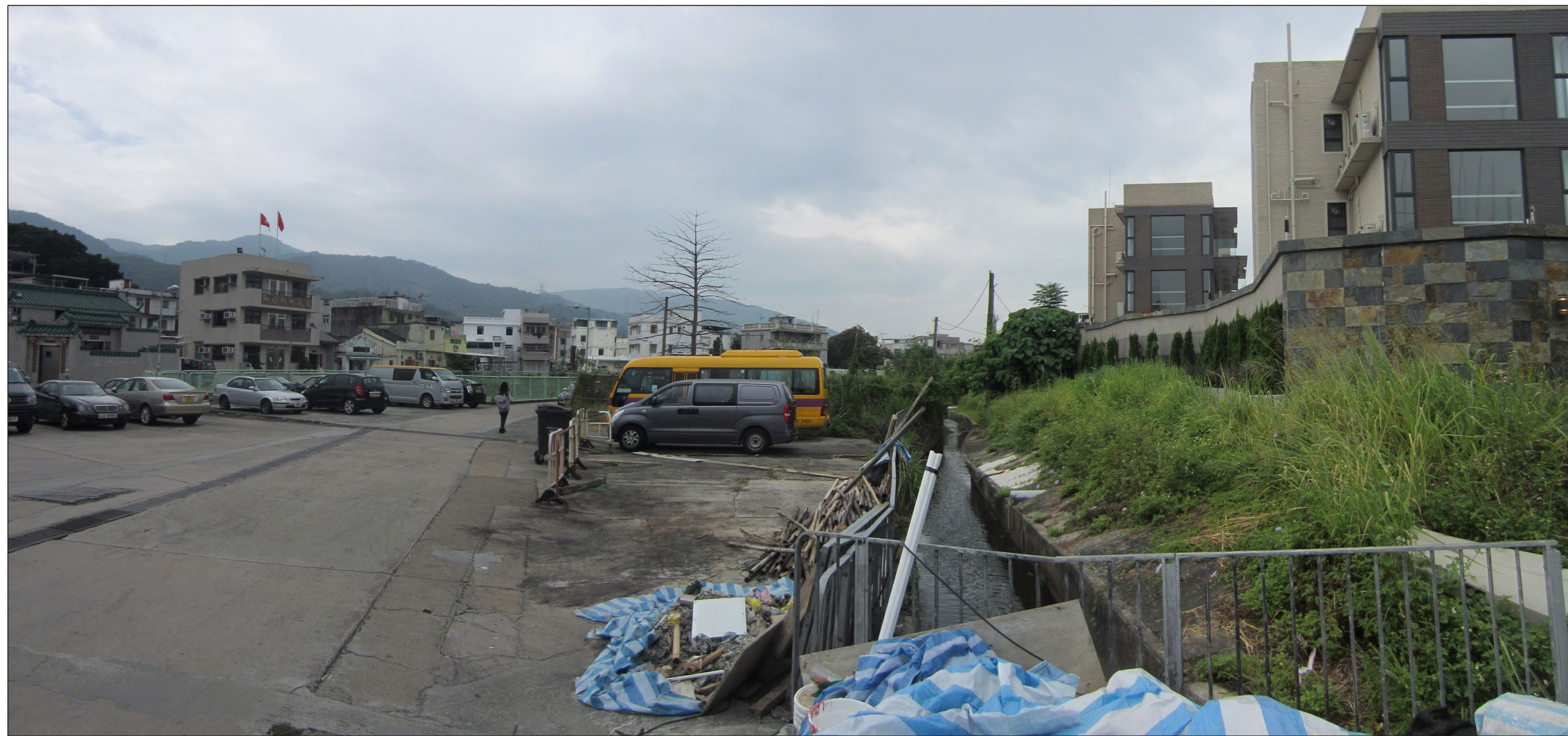
Vantage Point 1: Residents and pedestrians at Lin Fa Tei Village Gateway (VSR 3) (Existing Situation)