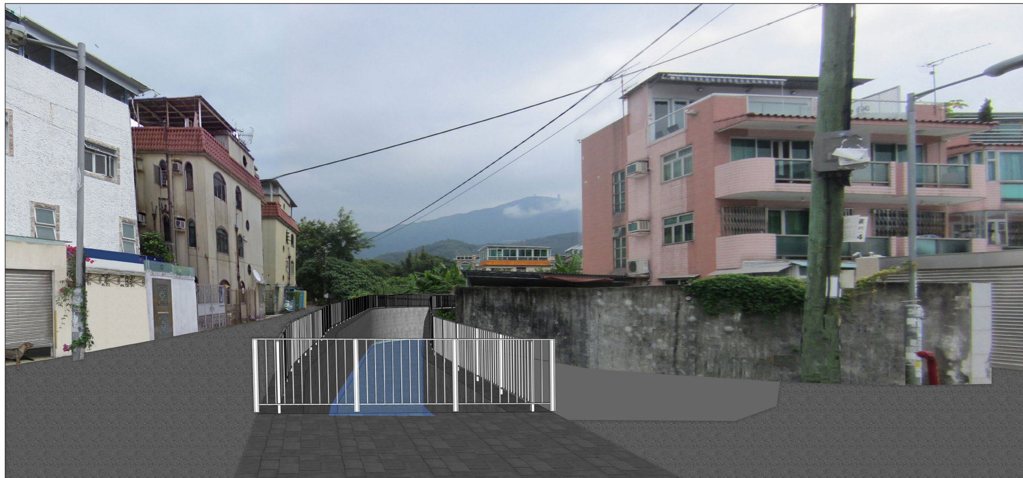
Vantage Point 2: Vehicle travellers and pedestrians at channel crossing in Lin Fa Tei (VSR 6) (Without Mitigation)