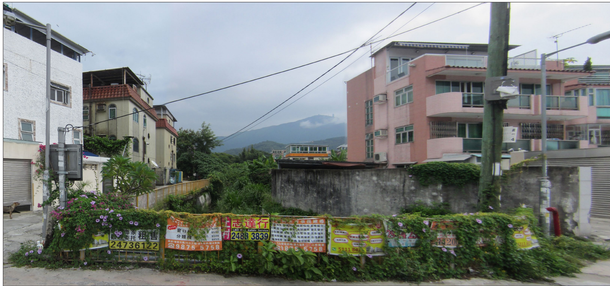
Vantage Point 2: Vehicle travellers and pedestrians at channel crossing in Lin Fa Tei (VSR 6) (Existing Situation)