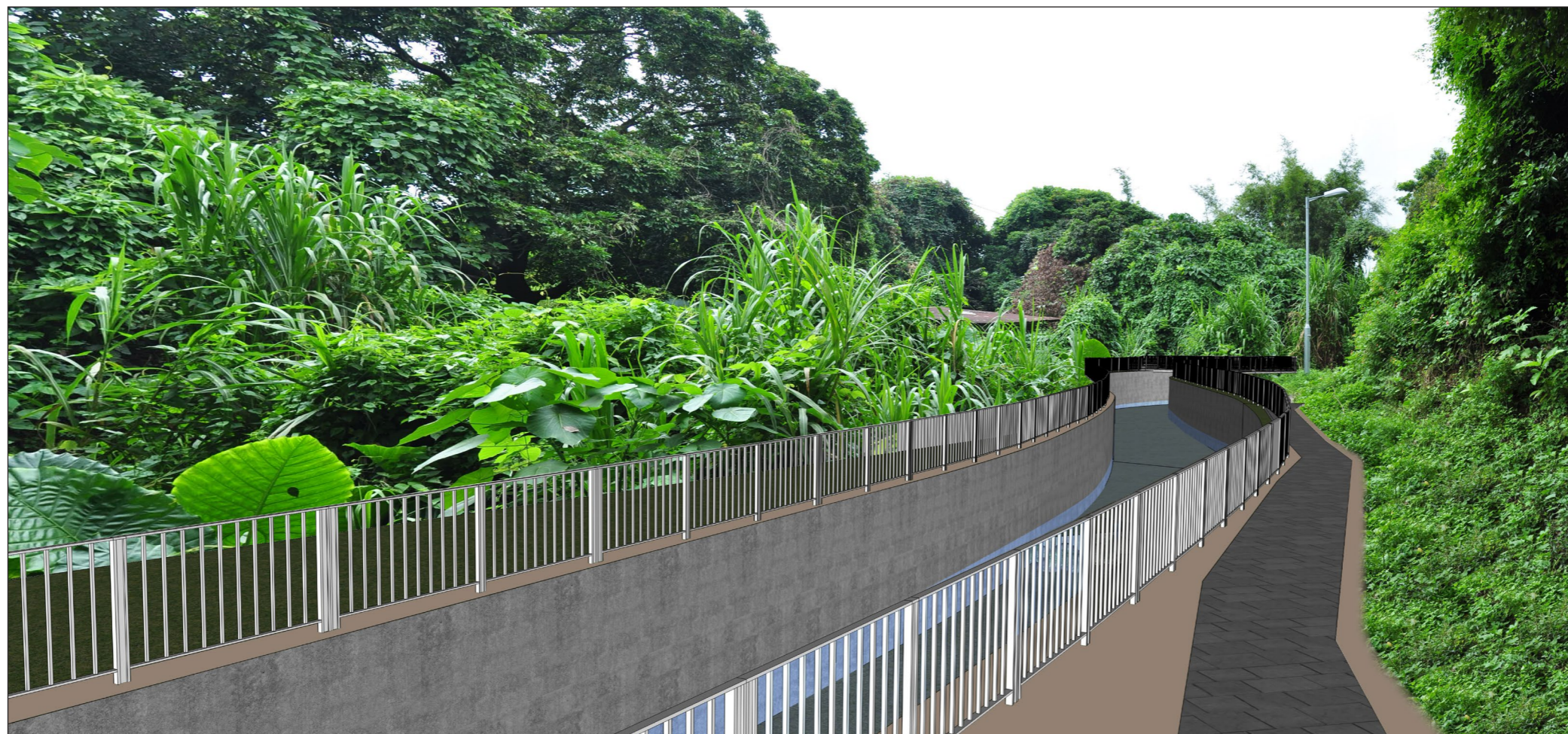
Vantage Point 3: Pedestrians on riverside footpath to south west of Lin Fa Tei (VSR 9) (Without Mitigation)