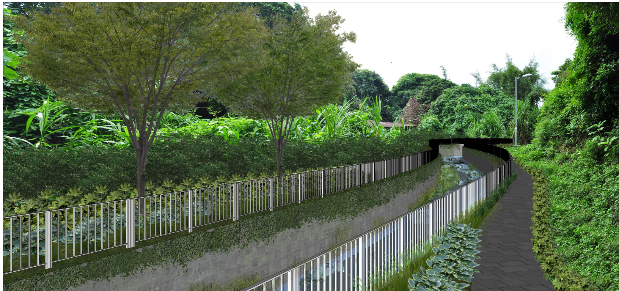
Vantage Point 3: Pedestrians on riverside footpath to south west of Lin Fa Tei (VSR 9) (With Mitigation) (Day One)