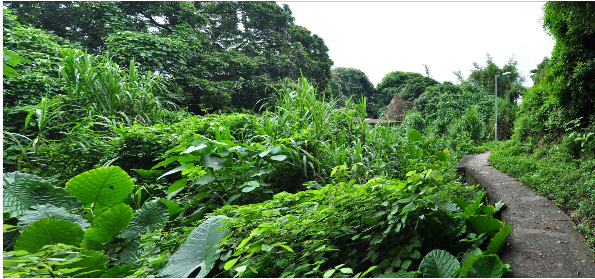
Vantage Point 3: Pedestrians on riverside footpath to south west of Lin Fa Tei (VSR 9) (Existing Situation)