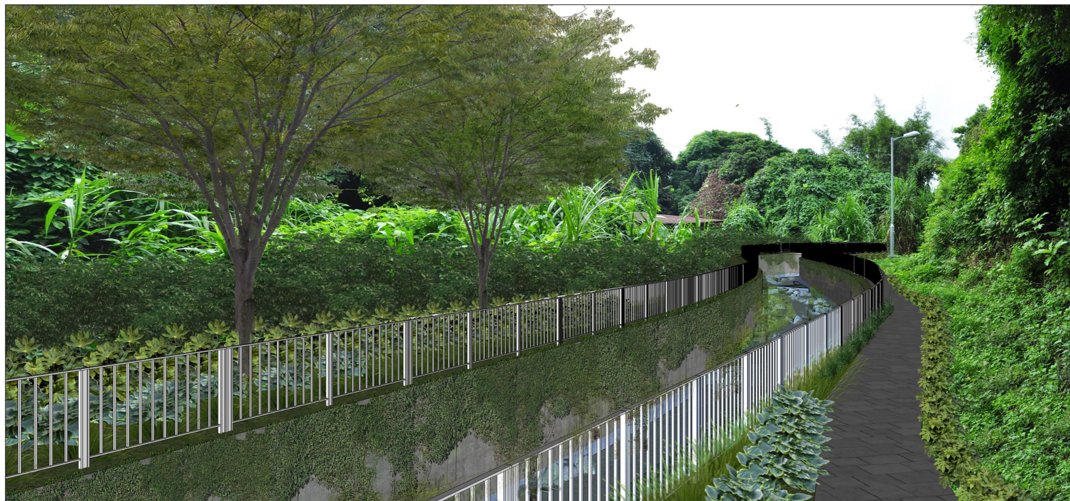
Vantage Point 3: Pedestrians on riverside footpath to south west of Lin Fa Tei (VSR 9) (With Mitigation) (Year Ten)