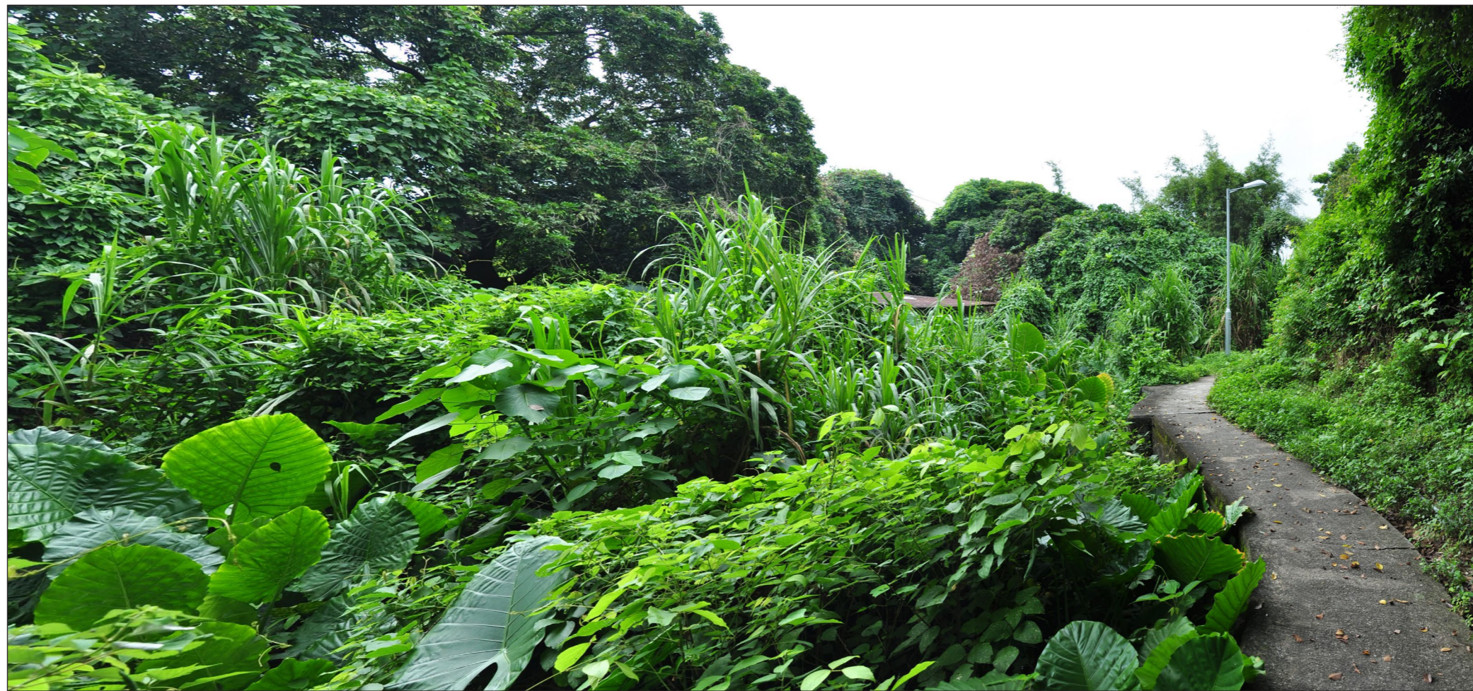
Vantage Point 3: Pedestrians on riverside footpath to south west of Lin Fa Tei (VSR 9) (Existing Situation)