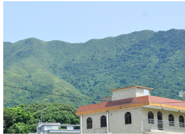
HC-LR5: GRASSLAND / SHRUBLAND