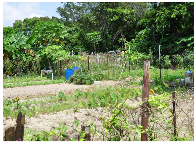
HC-LR1: Agricultural Land