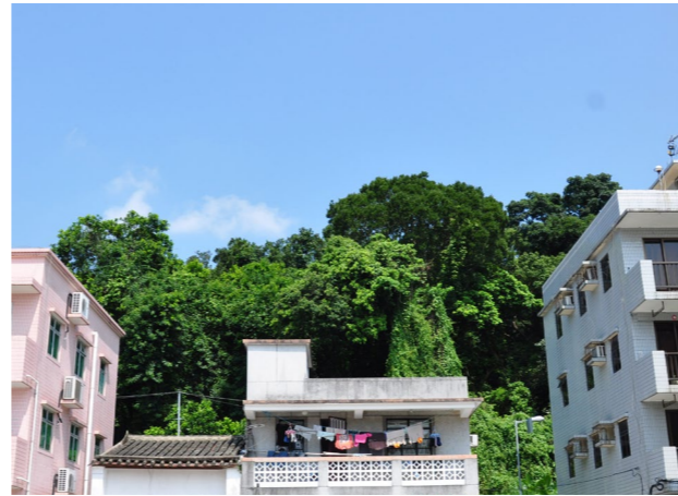
HC-LR7: FUNG SHUI WOOD