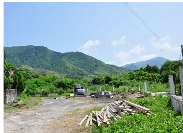
HC-LR10: WASTE GROUND