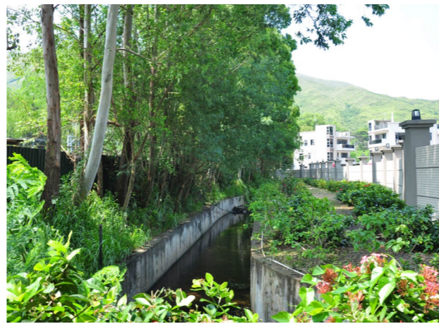
HC-LR3: WATER COURSE