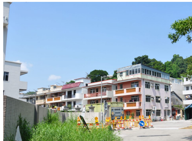
HC-LR11: URBAN / RESIDENTIAL AREA