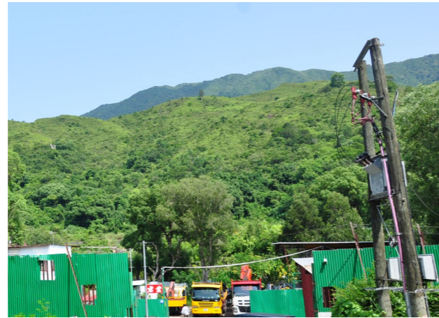
HC-LR6: SECONDARY WOODLAND