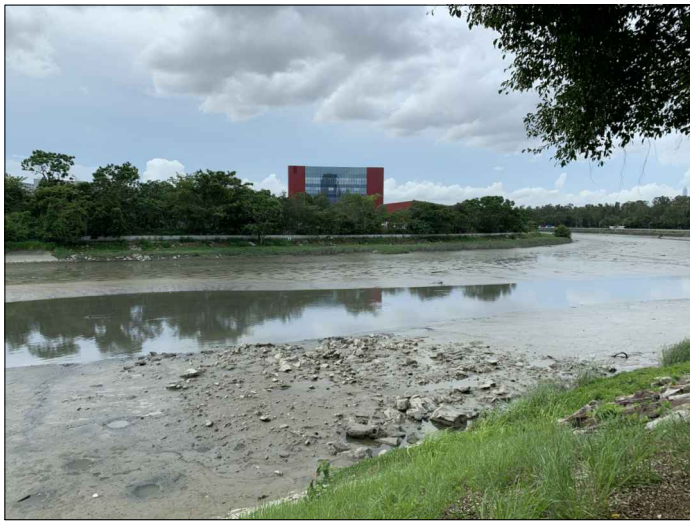
LCA9 RIVER CORRIDOR LANDSCAPE